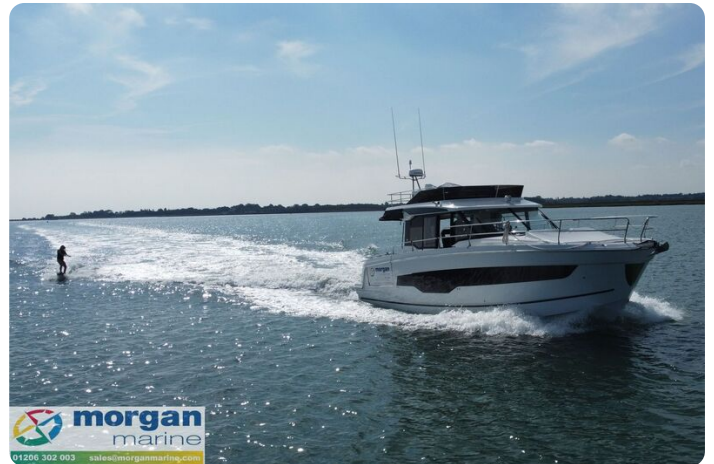
Jeanneau Merry Fisher 1295 Flybridge - wakeboarding - starboard side view