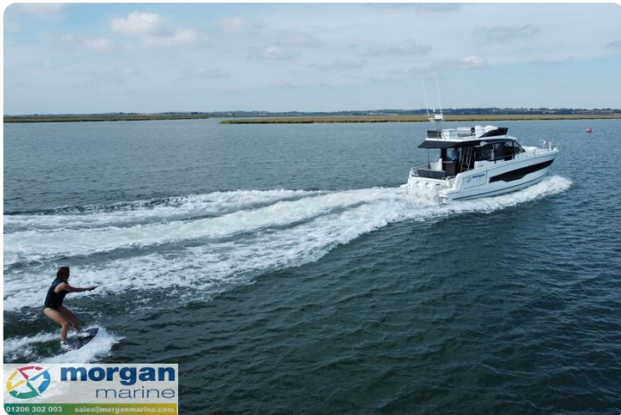
Jeanneau Merry Fisher 1295 Flybridge - wakeboarding - view towards aft