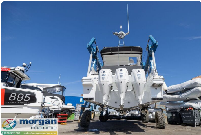
Jeanneau Merry Fisher 1295 Flybridge - triple Yamaha engines