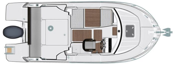
Jeanneau Merry Fisher 605 - diagram of overhead view