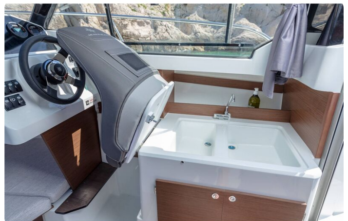
Jeanneau Merry Fisher 605 - galley behind helm seat