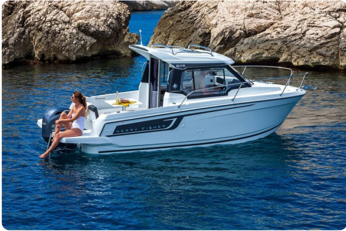
Jeanneau Merry Fisher 605 - on the water