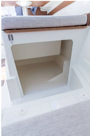
Jeanneau Merry Fisher 605 - under seat storage