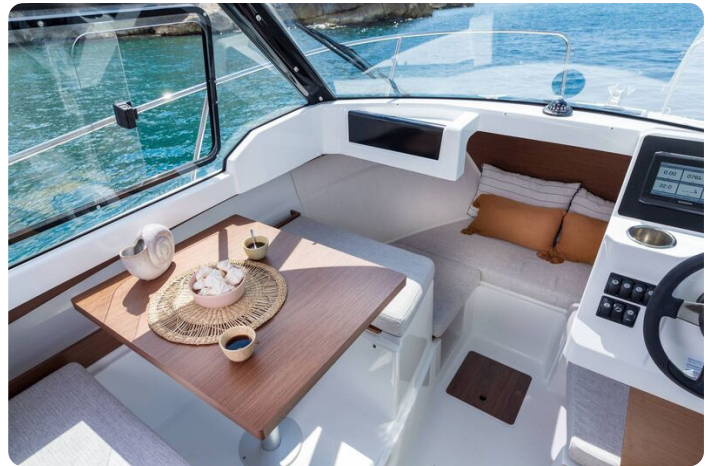
Jeanneau Merry Fisher 605 - wheelhouse port side table