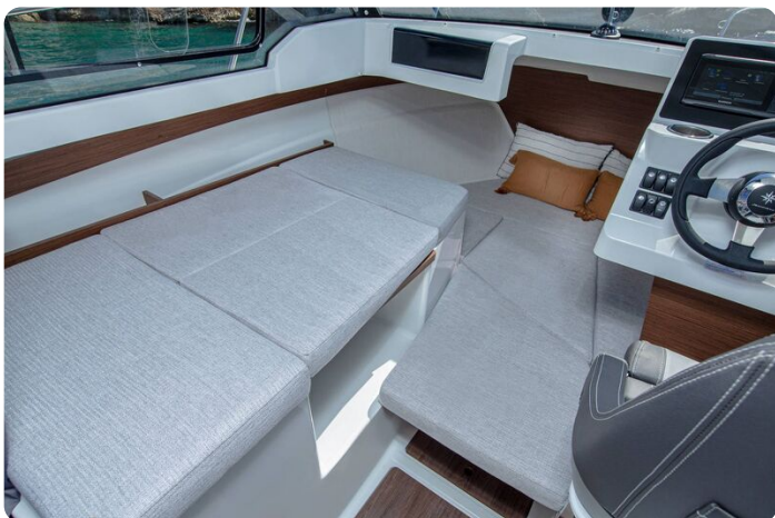
Jeanneau Merry Fisher 605 - cabin cushions and saloon berth conversion