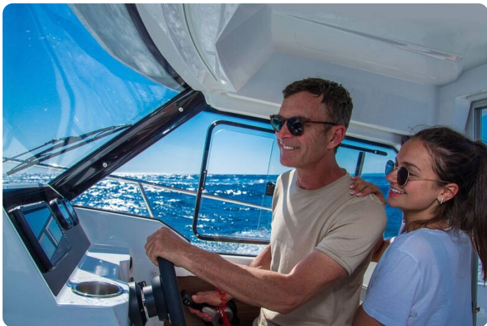
Jeanneau Merry Fisher 605 - pilot seat looking out of starboard window