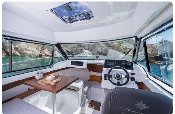
Jeanneau Merry Fisher 605 - wheelhouse overview and roof hatch