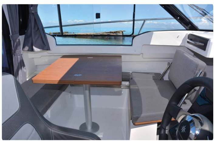
Jeanneau Merry Fisher 695 wheelhouse boat - co-pilot seat converts to seating at table