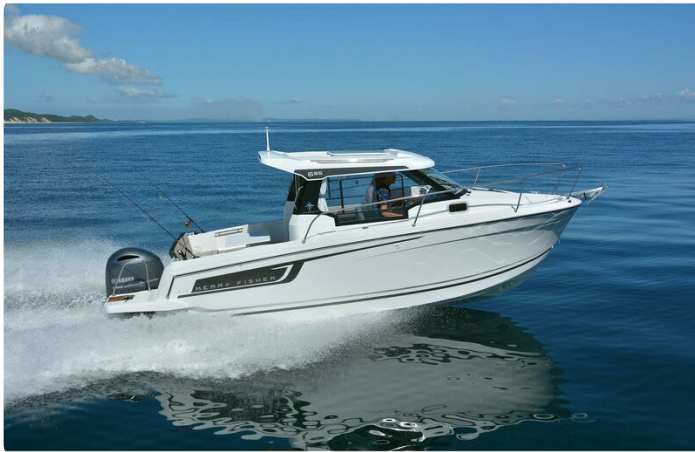
Jeanneau Merry Fisher 695 wheelhouse boat - on the water