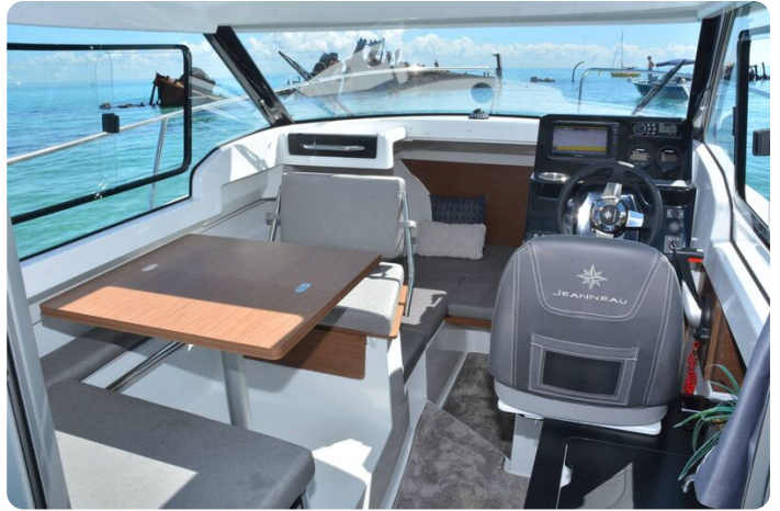
Jeanneau Merry Fisher 695 wheelhouse boat - wheelhouse with port side saloon and starboard side helm position and galley