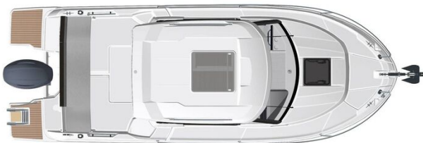
Jeanneau Merry Fisher 695 wheelhouse boat - diagram of wheelhouse roof