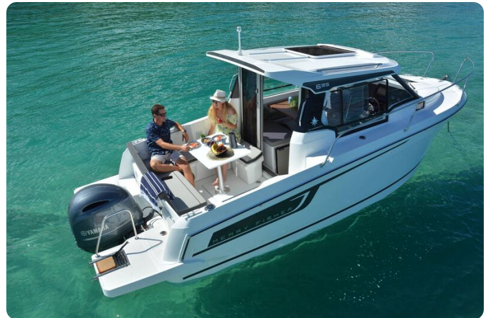
Jeanneau Merry Fisher 695 wheelhouse boat - sitting at the cockpit table