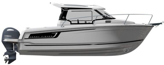
Jeanneau Merry Fisher 695 wheelhouse boat - diagram of side view