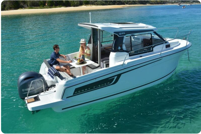
Jeanneau Merry Fisher 695 wheelhouse boat