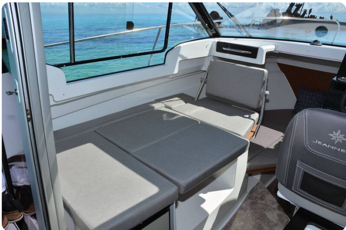
Jeanneau Merry Fisher 695 wheelhouse boat - wheelhouse saloon converts to berth