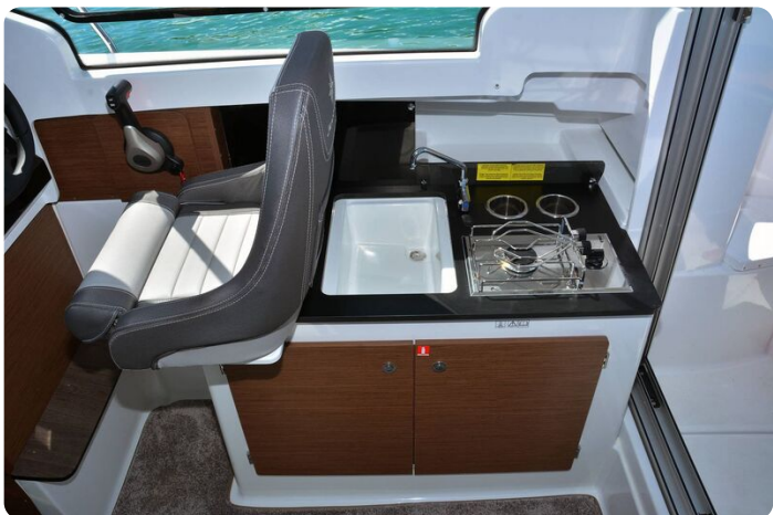
Jeanneau Merry Fisher 695 wheelhouse boat - starboard side galley