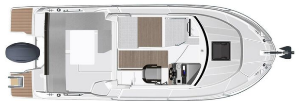
Jeanneau Merry Fisher 695 wheelhouse boat - diagram of cockpit seating and wheelhouse layout