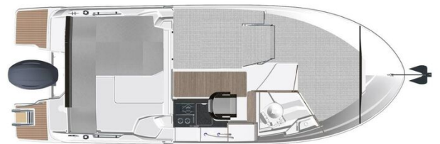
Jeanneau Merry Fisher 695 wheelhouse boat - diagram of berths in wheelhouse and cabin