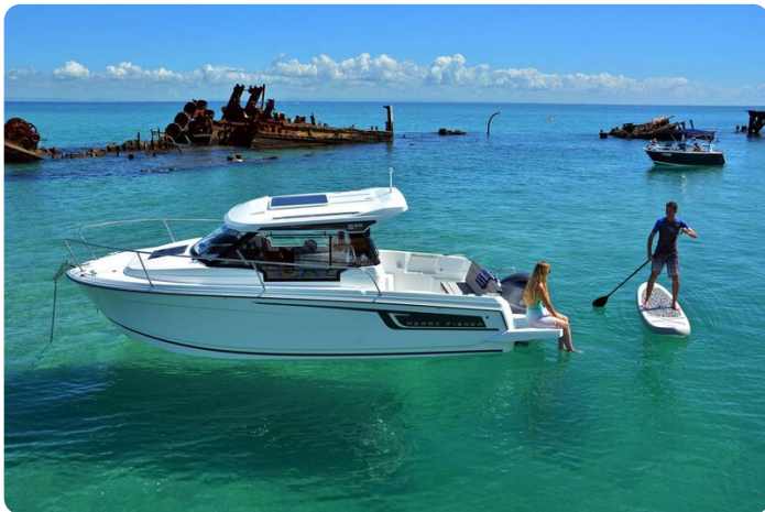
Jeanneau Merry Fisher 695 wheelhouse boat - great for paddle boarding