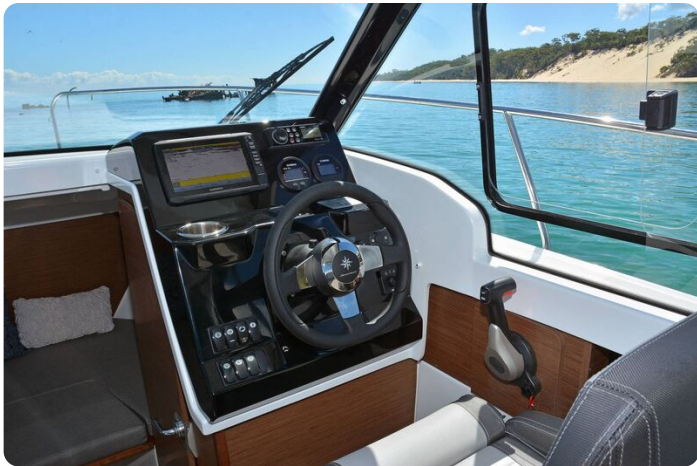
Jeanneau Merry Fisher 695 wheelhouse boat - helm position