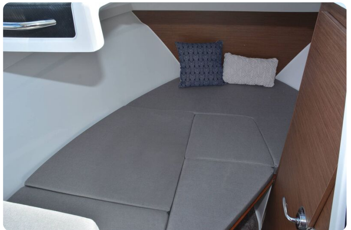
Jeanneau Merry Fisher 695 wheelhouse boat - cabin with double berth