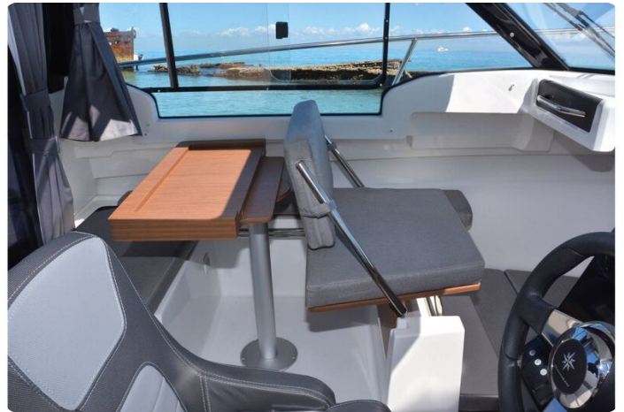
Jeanneau Merry Fisher 695 wheelhouse boat - co-pilot seat