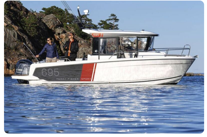
Jeanneau Merry Fisher 695 Sport