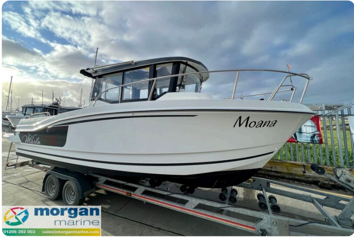
Jeanneau Merry Fisher 795 Marlin - starboard side