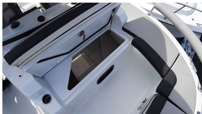
Jeanneau Merry Fisher 796 Sport - hatch to cabin