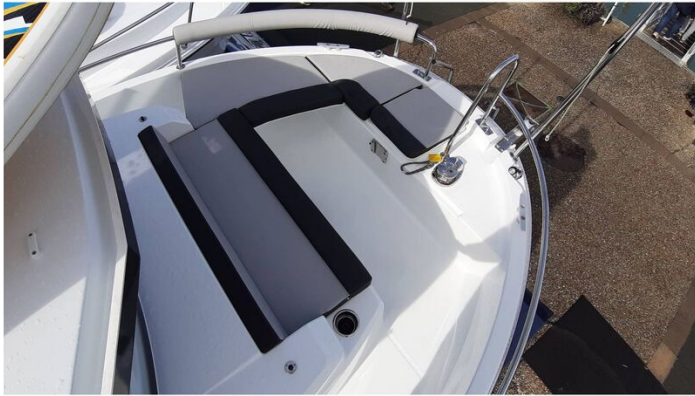
Jeanneau Merry Fisher 796 Sport - cushioned bow seating