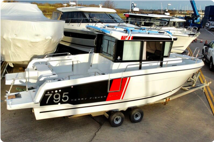
Merry Fisher 795 Sport - in stock at Morgan Marine - view towards cockpit