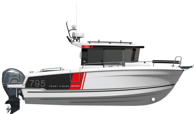
Jeanneau Merry Fisher 796 Sport - diagram of side view