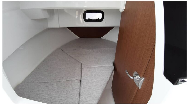
Jeanneau Merry Fisher 796 Sport - forward cabin