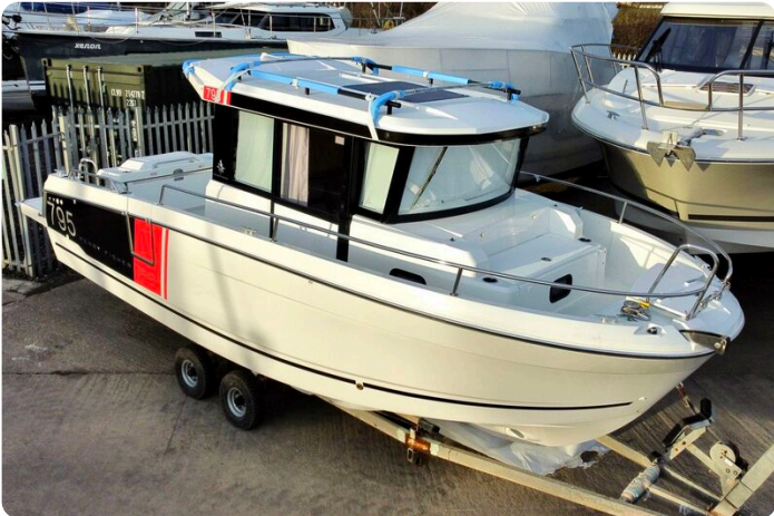
Merry Fisher 795 Sport - in stock at Morgan Marine - view towards bow