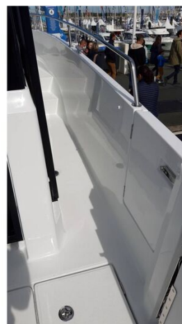
Jeanneau Merry Fisher 796 Sport - wide and deep side decks