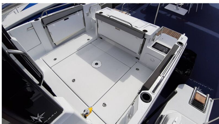
Jeanneau Merry Fisher 796 Sport - folded bench seats