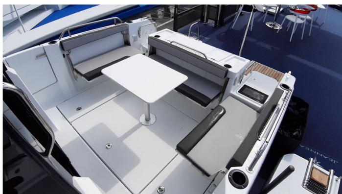
Jeanneau Merry Fisher 796 Sport - aft cockpit with cushioned bench seats