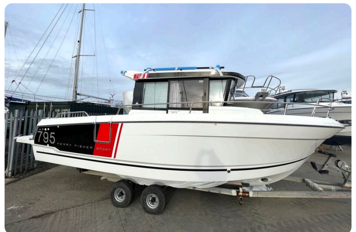
Merry Fisher 795 Sport - in stock at Morgan Marine