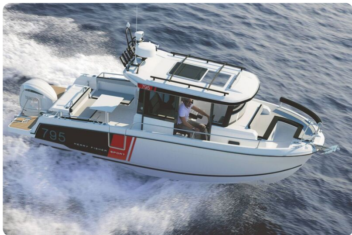
Jeanneau Merry Fisher 796 Sport