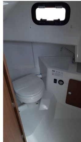
Jeanneau Merry Fisher 796 Sport - toilet compartment