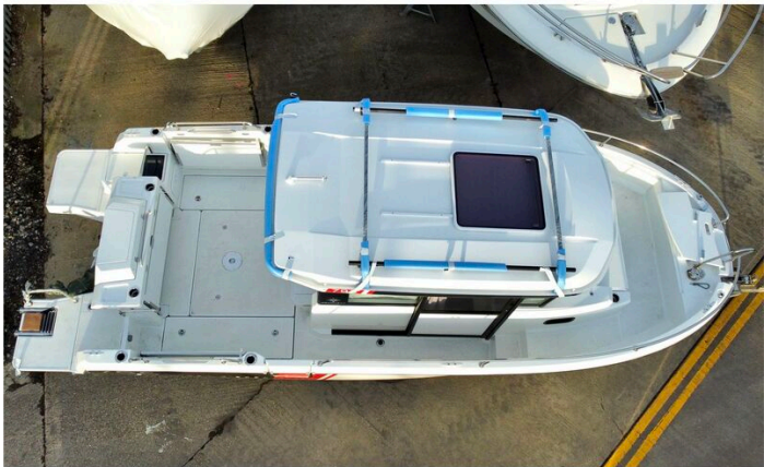
Merry Fisher 795 Sport - in stock at Morgan Marine - overhead view of wheelhouse roof