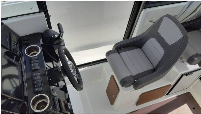
Jeanneau Merry Fisher 796 Sport - helm position with bolster seat