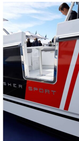
Jeanneau Merry Fisher 796 Sport - side door for easy access to pontoons