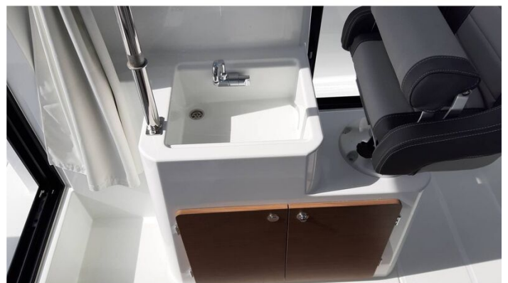
Jeanneau Merry Fisher 795 Sport - Series 2 - galley behind helm seat