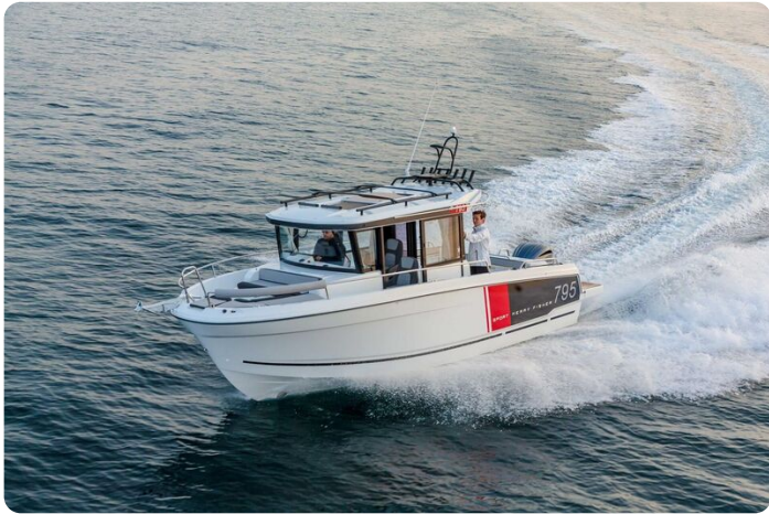
Jeanneau Merry Fisher 795 Sport - Series 2 - on the water