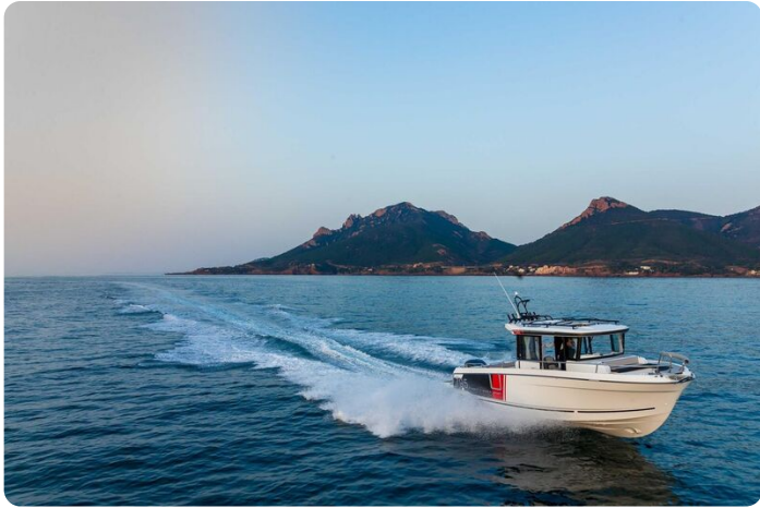
Jeanneau Merry Fisher 795 Sport - Series 2 - moving through the water