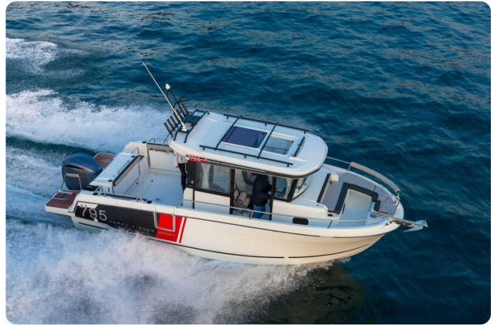
Jeanneau Merry Fisher 795 Sport - Series 2 - overhead view of starboard on the water