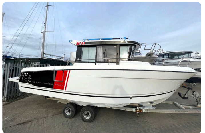
Jeanneau Merry Fisher 795 Sport - Series 2 - at Morgan Marine