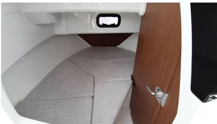
Jeanneau Merry Fisher 795 Sport - Series 2 - forward cuddy with cushions