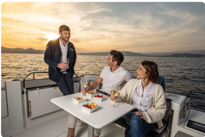
Jeanneau Merry Fisher 795 Sport - Series 2 - aft cockpit table and seating