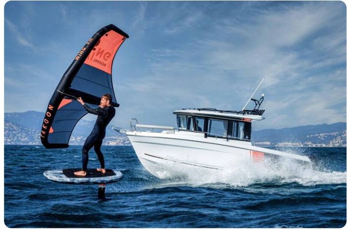
Jeanneau Merry Fisher 795 Sport - Series 2 - great for paddleboards and fun on the water