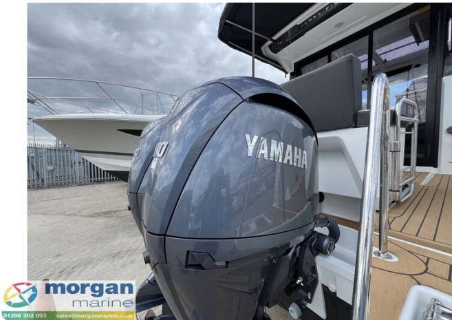
Jeanneau Merry Fisher 895 Series 2 - Yamaha outboard engines