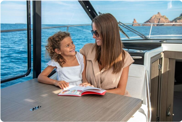
Jeanneau Merry Fisher 895 - sitting at the saloon table