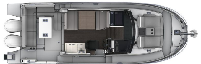
Jeanneau Merry Fisher 895 - diagram of cockpit seating, wheelhouse interior and bow sun lounger