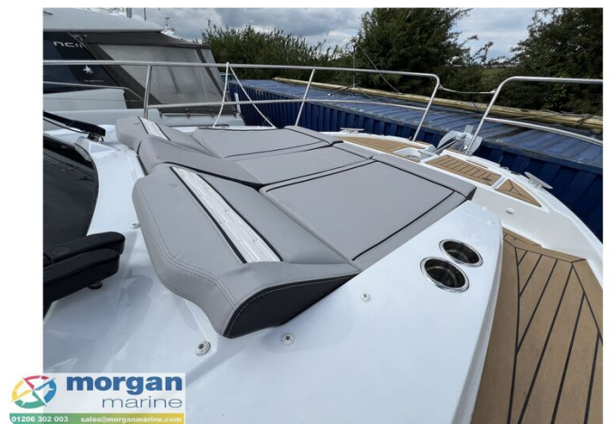
Jeanneau Merry Fisher 895 Series 2 - view from bow seating to pulpits rails