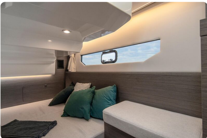
Jeanneau Merry Fisher 895 - aft cabin