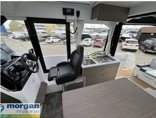
Jeanneau Merry Fisher 895 Series 2 - helm side door