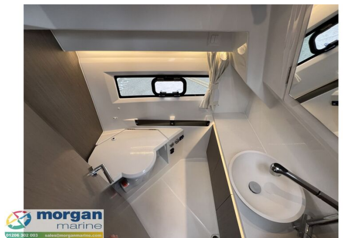
Jeanneau Merry Fisher 895 Series 2 - toilet and shower compartment