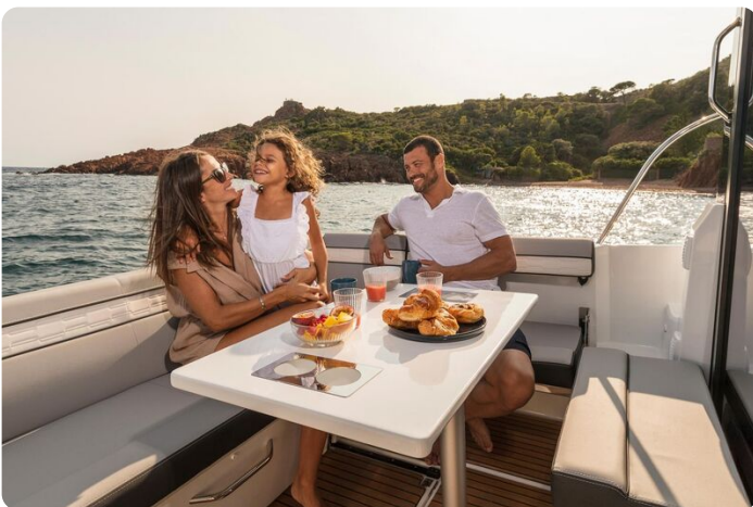
Jeanneau Merry Fisher 895 - dining at the cockpit table