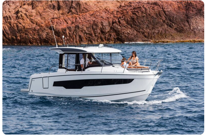
Jeanneau Merry Fisher 895 - relaxing on the water