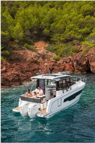
Jeanneau Merry Fisher 895 - in beautiful surroundings