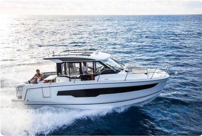
Jeanneau Merry Fisher 895 - starboard side view