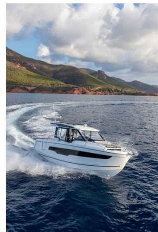
Jeanneau Merry Fisher 895 - on the water with large wake