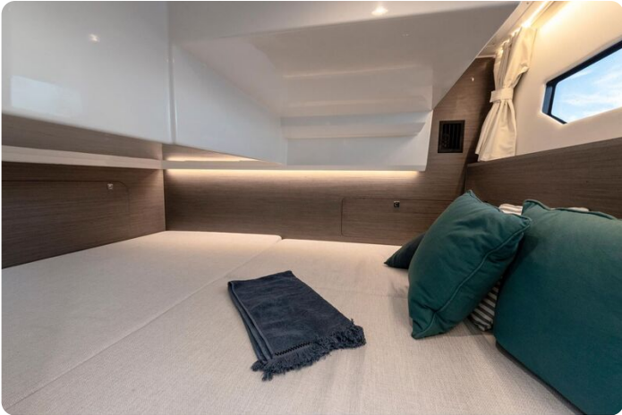
Jeanneau Merry Fisher 895 - double berth in aft cabin