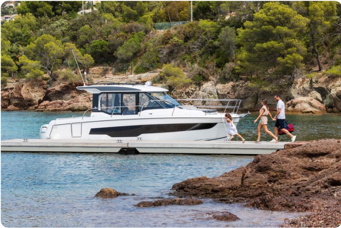
Jeanneau Merry Fisher 895 - walking along the pontoon