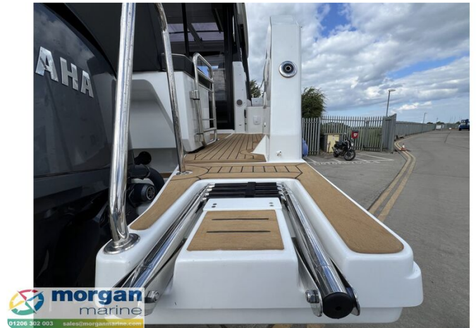
Jeanneau Merry Fisher 895 Series 2 - swim platform with folding boarding ladder