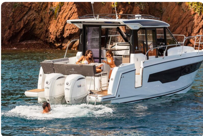
Jeanneau Merry Fisher 895 - transom with twin engines and swim platforms