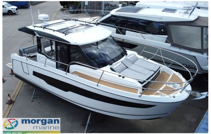
Jeanneau Merry Fisher 895 Series 2