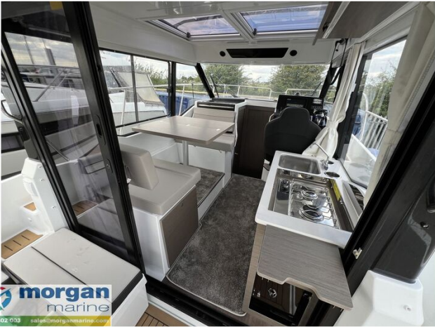
Jeanneau Merry Fisher 895 Series 2 - wheelhouse with saloon and galley