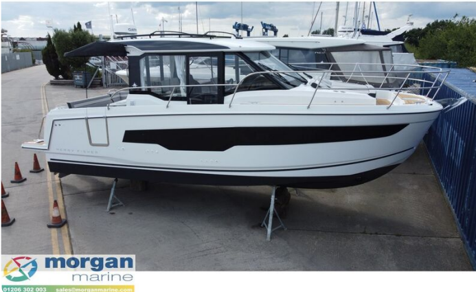
Jeanneau Merry Fisher 895 Series 2 - towards starboard side