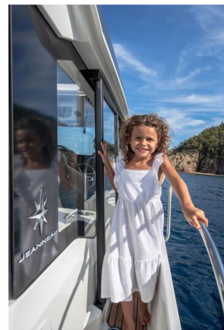
Jeanneau Merry Fisher 895 - deep and safe side decks