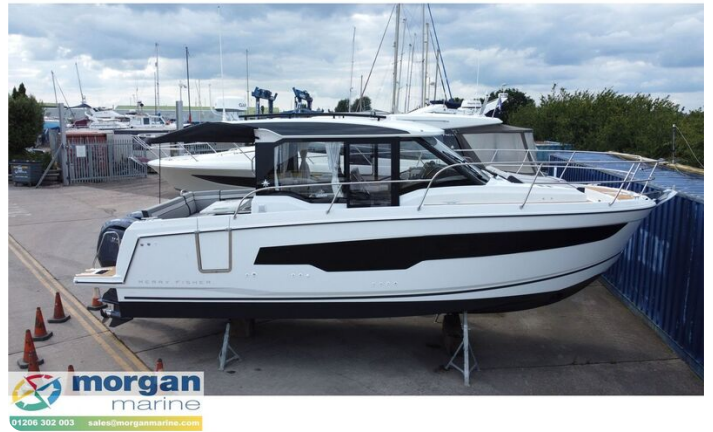
Jeanneau Merry Fisher 895 Series 2 - overhead view to starboard side