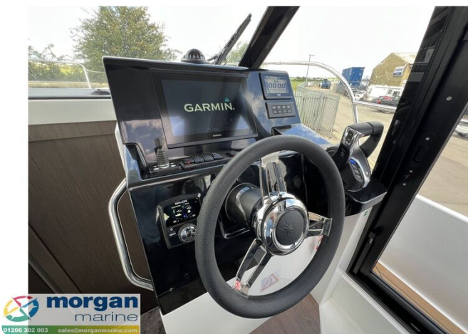
Jeanneau Merry Fisher 895 Series 2 - helm position and side door