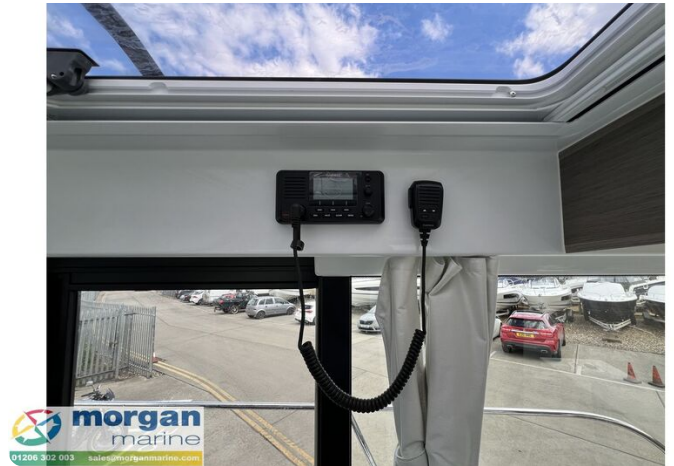
Jeanneau Merry Fisher 895 Series 2 - VHF radio