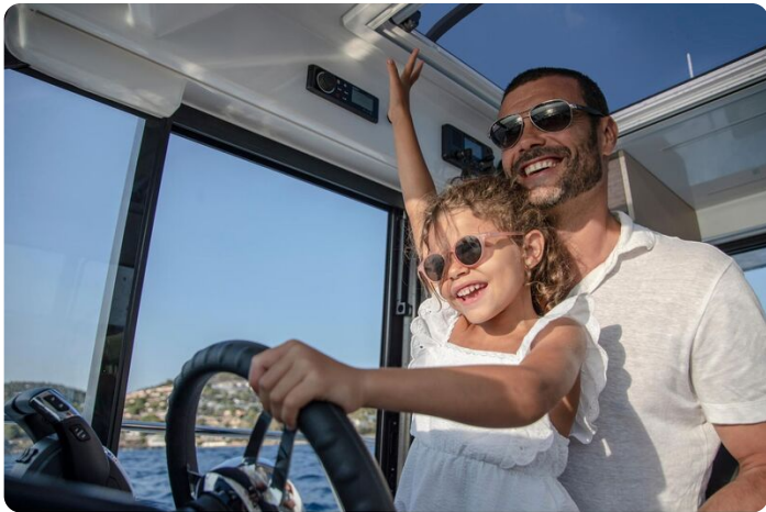
Jeanneau Merry Fisher 895 - sitting at helm position