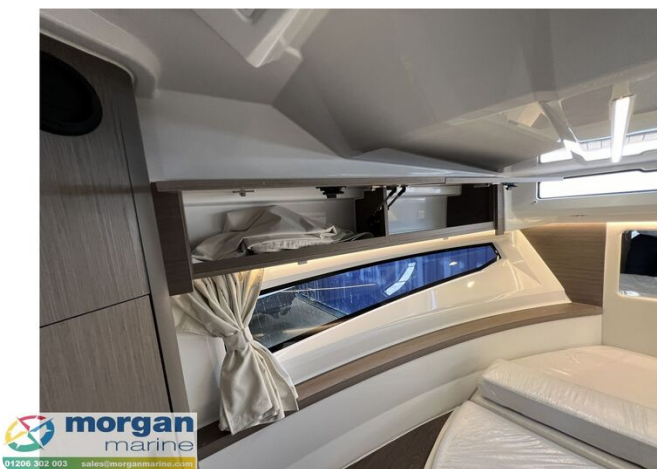
Jeanneau Merry Fisher 895 Series 2 - storage and large window