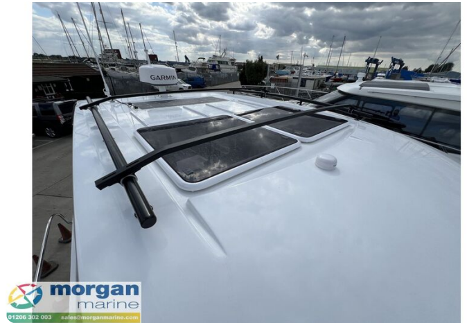
Jeanneau Merry Fisher 895 Series 2 - wheelhouse roof