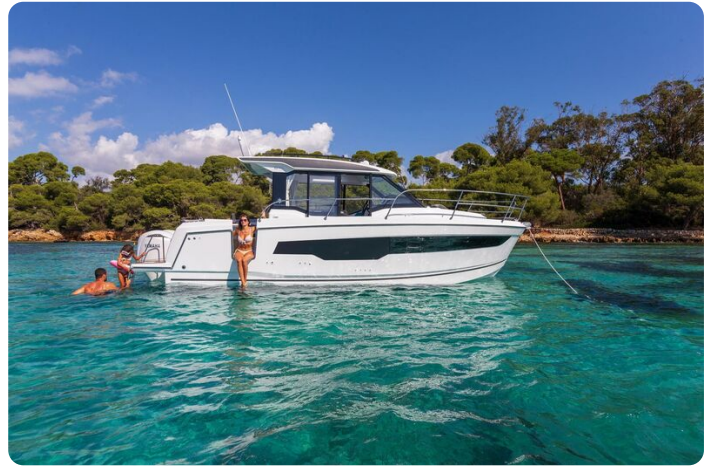
Jeanneau Merry Fisher 895 - easy access to the water from the wide boarding door