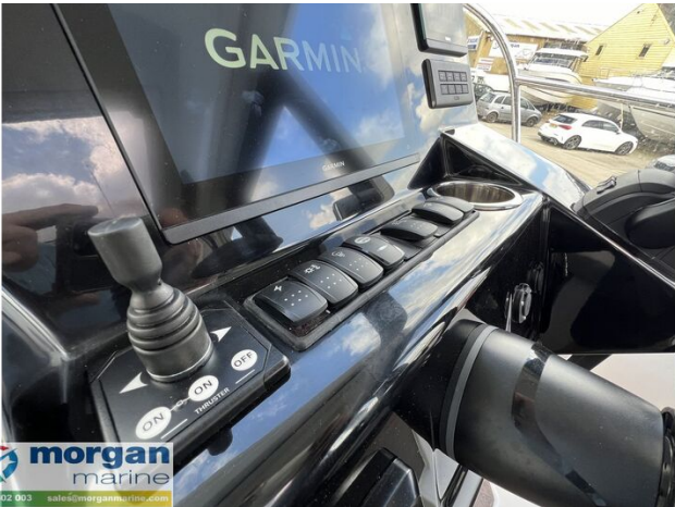
Jeanneau Merry Fisher 895 Series 2 - switch panel and Garmin screen