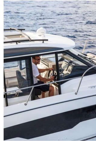
Jeanneau Merry Fisher 895 - helm side door for easy access to the side deck and cleats