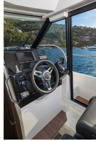
Jeanneau Merry Fisher 895 - helm position