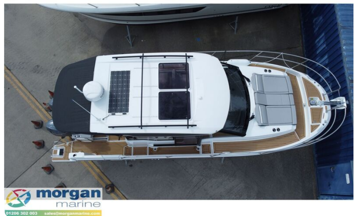
Jeanneau Merry Fisher 895 Series 2 - overhead view