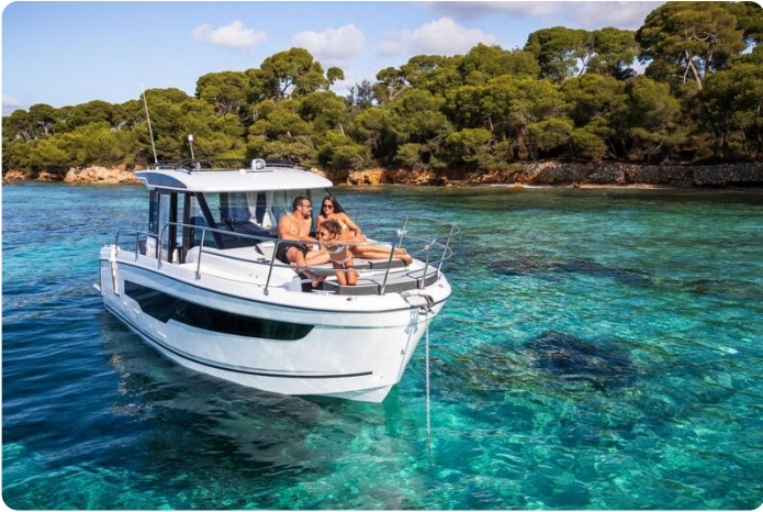
Jeanneau Merry Fisher 895 - relaxing on the forward sun lounger