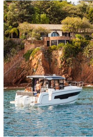
Jeanneau Merry Fisher 895 - near a chateaux