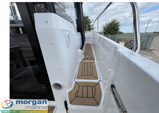
Jeanneau Merry Fisher 895 Series 2 - starboard side deck