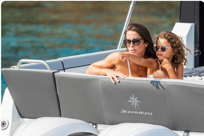
Jeanneau Merry Fisher 895 - people looking out over the aft cockpit bench seat