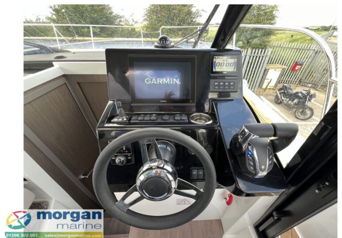
Jeanneau Merry Fisher 895 Series 2 - engine controls