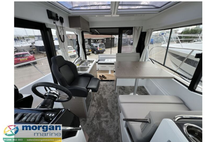
Jeanneau Merry Fisher 895 Series 2 - rotating helm seat