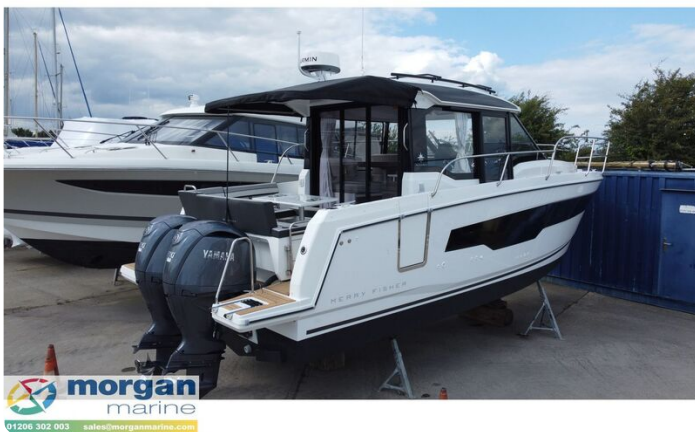
Jeanneau Merry Fisher 895 Series 2 - overhead view to starboard aft