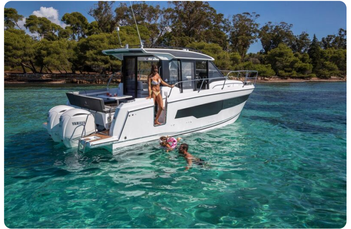
Jeanneau Merry Fisher 895 - wide boarding door on starboard side