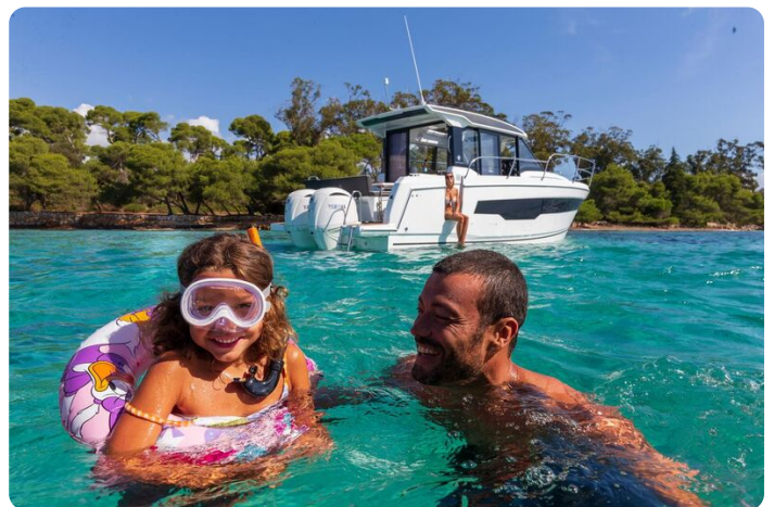
Jeanneau Merry Fisher 895 - fun in the water