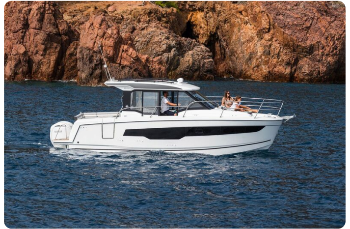
Jeanneau Merry Fisher 895 - on the water