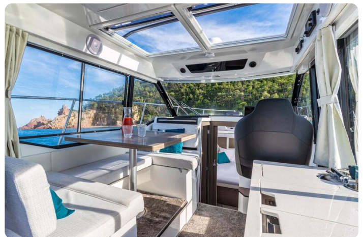
Jeanneau Merry Fisher 895 - wheelhouse with port side saloon and starboard side galley and helm position