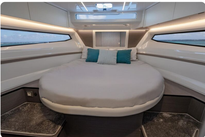
Jeanneau Merry Fisher 895 - forward cabin with double berth