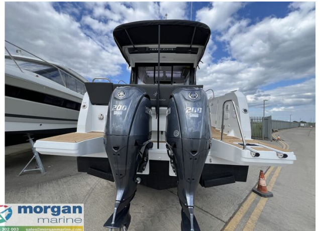
Jeanneau Merry Fisher 895 Series 2 - transom with twin Yamaha 200 outboards