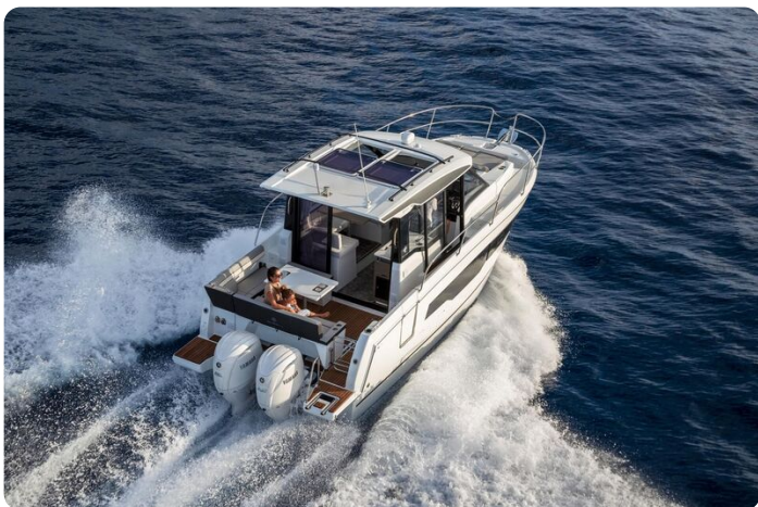
Jeanneau Merry Fisher 895 - overhead view from starboard side aft