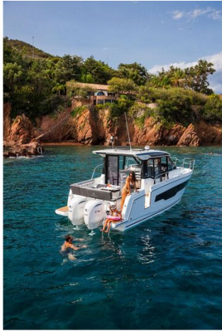
Jeanneau Merry Fisher 895 - swim platforms