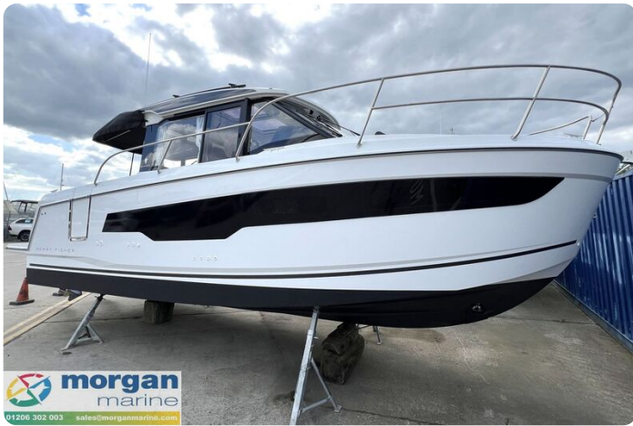
Jeanneau Merry Fisher 895 Series 2 - starboard side