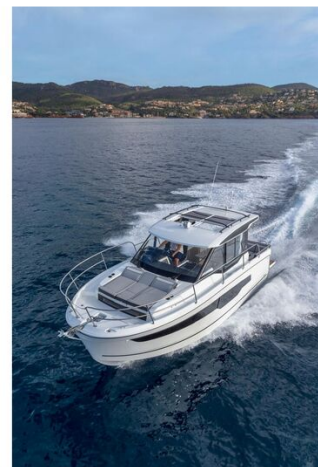
Jeanneau Merry Fisher 895 - on the water