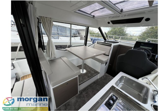
Jeanneau Merry Fisher 895 Series 2 - port side table