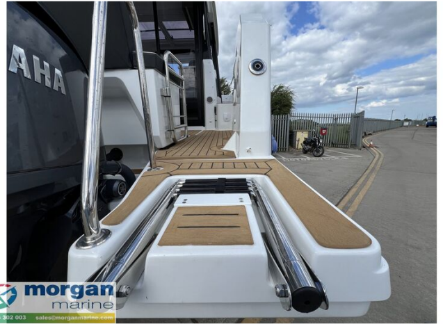
Jeanneau Merry Fisher 895 Series 2 - swim platform with folding boarding ladder