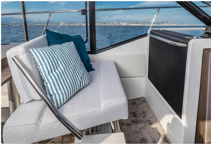
Jeanneau Merry Fisher 895 - co-pilot seat