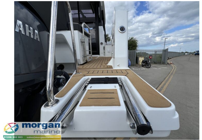
Jeanneau Merry Fisher 895 Series 2 - swim platform with folding boarding ladder