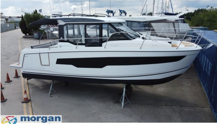
Jeanneau Merry Fisher 895 Series 2 - towards starboard side