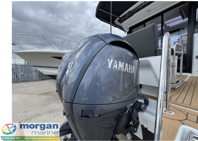
Jeanneau Merry Fisher 895 Series 2 - Yamaha outboard engines