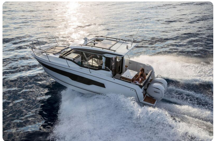
New Jeanneau Merry Fisher 895 - overhead view from port side