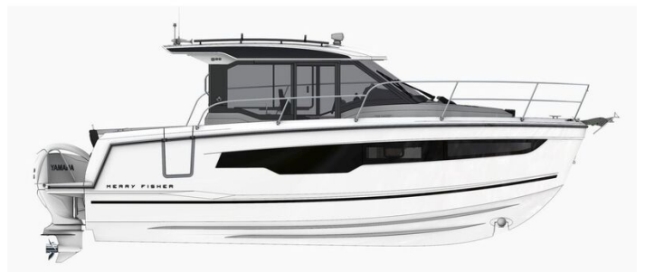
New Jeanneau Merry Fisher 895 - diagram of starboard side