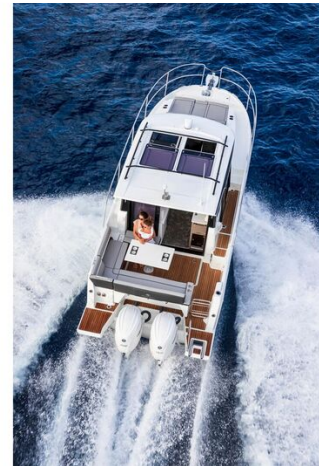
New Jeanneau Merry Fisher 895 - overhead view from aft