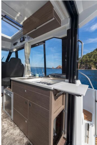
New Jeanneau Merry Fisher 895 - starboard side galley in wheelhouse