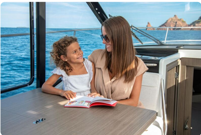
New Jeanneau Merry Fisher 895 - co-pilot seat reverses for seating at table