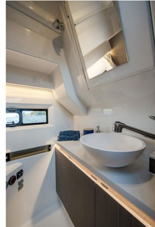
New Jeanneau Merry Fisher 895 - toilet compartment