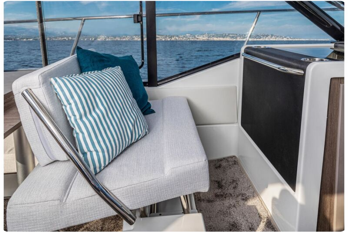
New Jeanneau Merry Fisher 895 - co-pilot seat