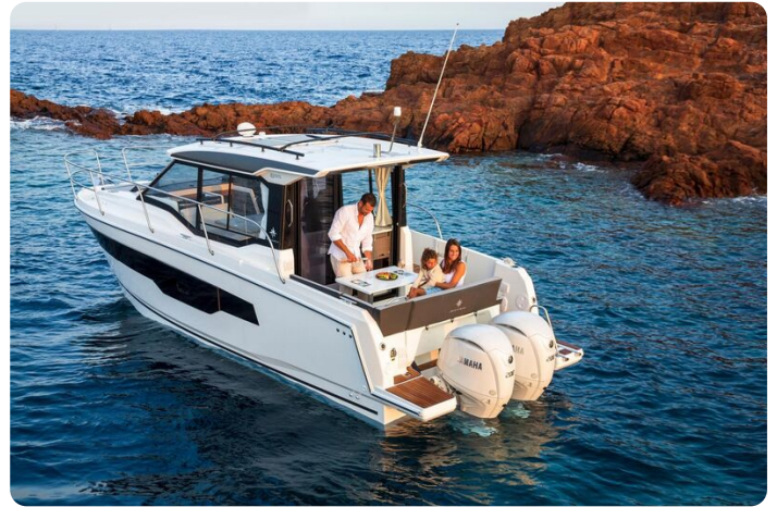
New Jeanneau Merry Fisher 895 - overhead view of transom and swim platform