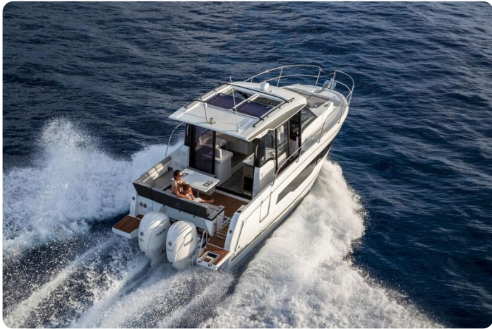
New Jeanneau Merry Fisher 895 - overhead view of cockpit seating