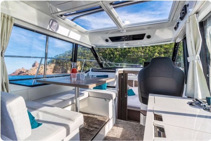
New Jeanneau Merry Fisher 895 - wheelhouse with port side saloon seating and starboard side galley