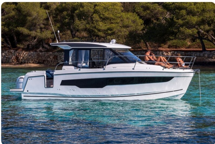
New Jeanneau Merry Fisher 895 - starboard side gate for easy access to moorings