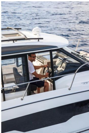
New Jeanneau Merry Fisher 895 - large helm side door