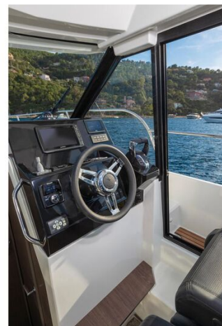
New Jeanneau Merry Fisher 895 - helm position