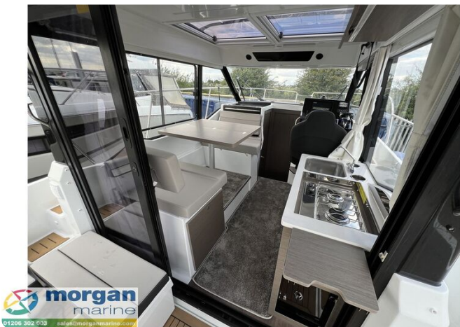
New Jeanneau Merry Fisher 895 - view from aft through wheelhouse