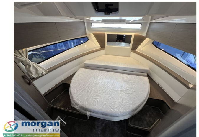
New Jeanneau Merry Fisher 895 - forward cabin