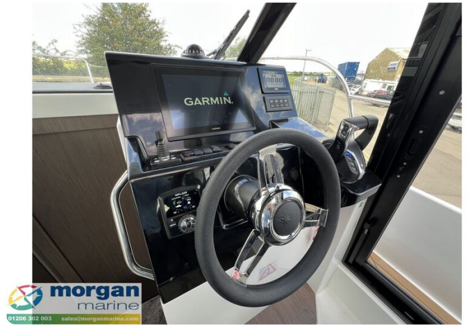
New Jeanneau Merry Fisher 895 - helm position and engine controls