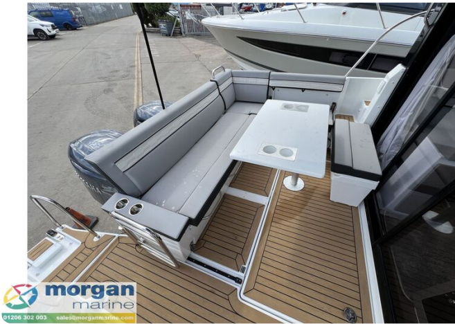
New Jeanneau Merry Fisher 895 - aft cockpit U shape seating