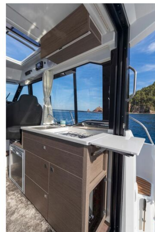
New Jeanneau Merry Fisher 895 - starboard side galley in wheelhouse