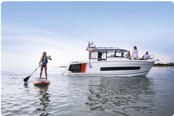
Jeanneau Merry Fisher 895 Sport - great for water-sports and fun on the water