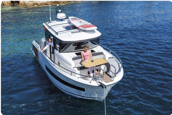
Jeanneau Merry Fisher 895 Sport