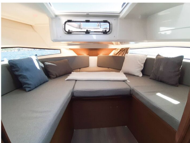
Jeanneau Merry Fisher 895 Sport - forward cabin with hatch to deck