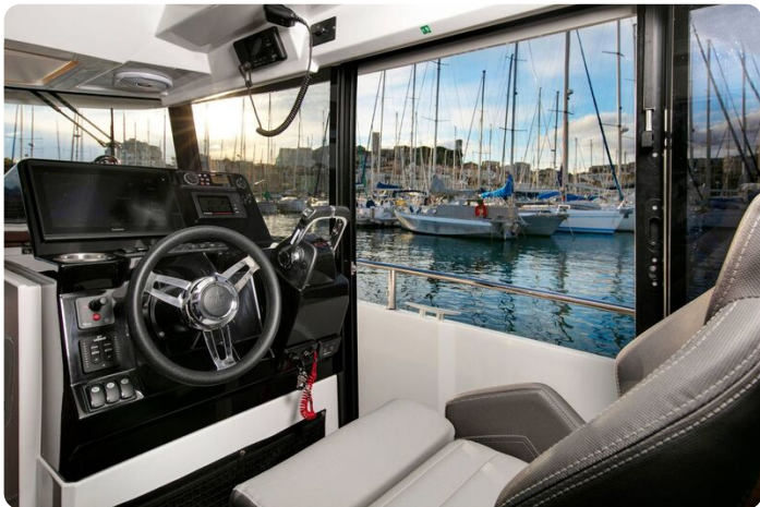
Jeanneau Merry Fisher 895 Sport - helm position and side door