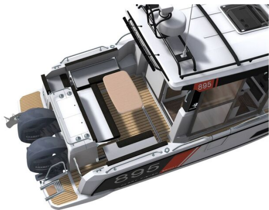
Jeanneau Merry Fisher 895 Sport - render of aft cockpit