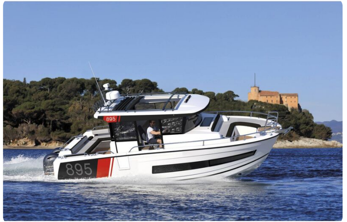
Jeanneau Merry Fisher 895 Sport - planing on the water