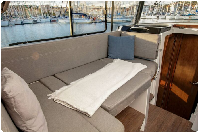
Jeanneau Merry Fisher 895 Sport - wheelhouse saloon seating with berth infill