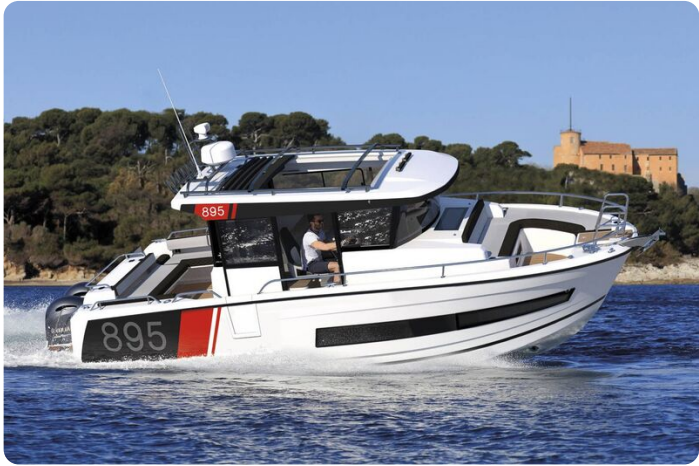
Jeanneau Merry Fisher 895 Sport