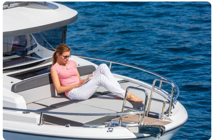
Jeanneau Merry Fisher 895 Sport - Offshore - bow seating