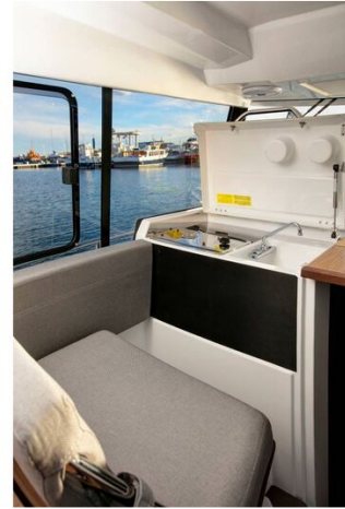
Jeanneau Merry Fisher 895 Sport - Offshore - galley in front of co-pilot seat