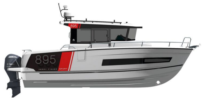
Jeanneau Merry Fisher 895 Sport - Offshore - diagram of side view