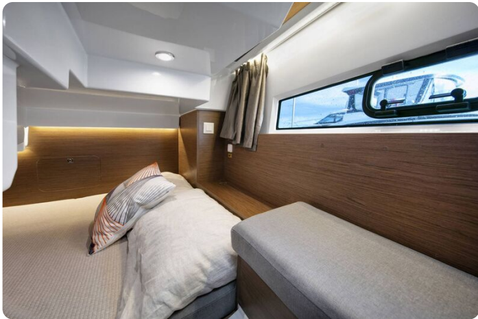
Jeanneau Merry Fisher 895 Sport - Offshore - aft cabin