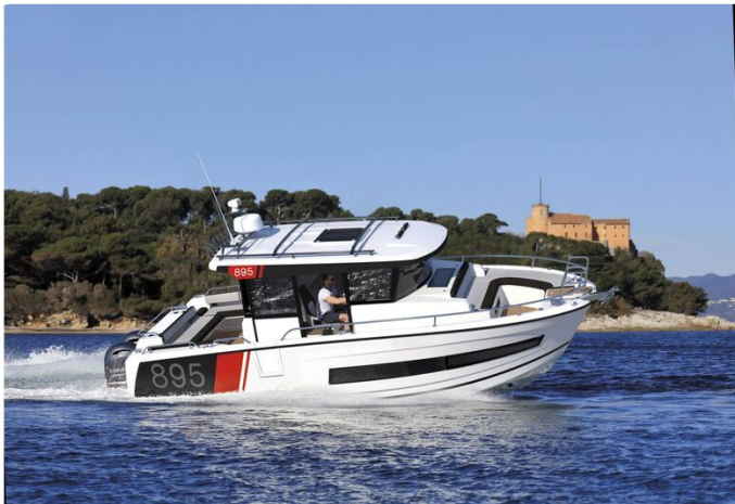
Jeanneau Merry Fisher 895 Sport - Offshore - on the water