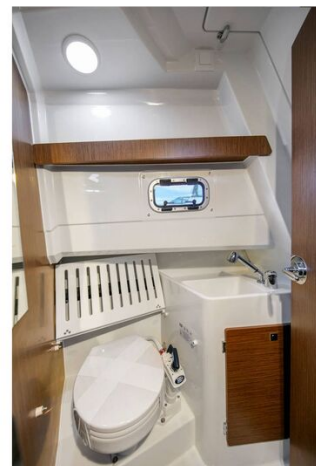
Jeanneau Merry Fisher 895 Sport - Offshore - toilet compartment with marine toilet