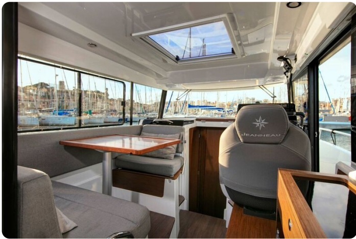
Jeanneau Merry Fisher 895 Sport - Offshore - wheelhouse interior