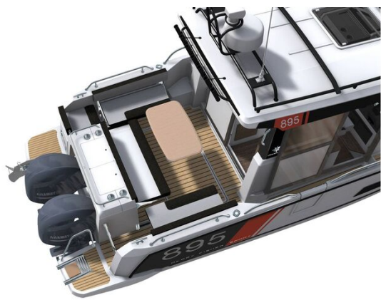
Jeanneau Merry Fisher 895 Sport - Offshore - render of aft cockpit with benches folded down