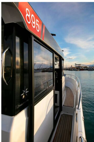
Jeanneau Merry Fisher 895 Sport - Offshore - starboard side deck