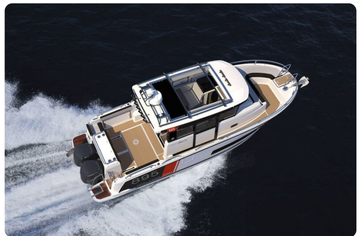
Jeanneau Merry Fisher 895 Sport - Offshore - render of overhead view