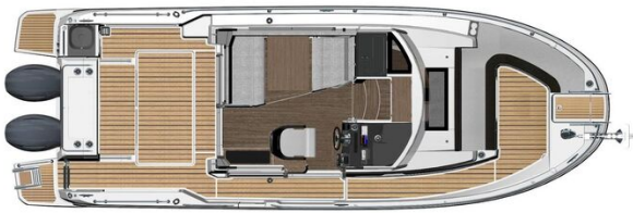
Jeanneau Merry Fisher 895 Sport - Offshore - layout diagram of wheelhouse seating