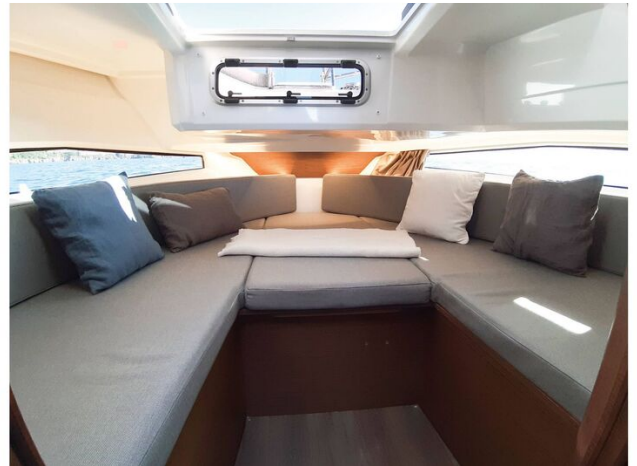
Jeanneau Merry Fisher 895 Sport - Offshore - forward cabin