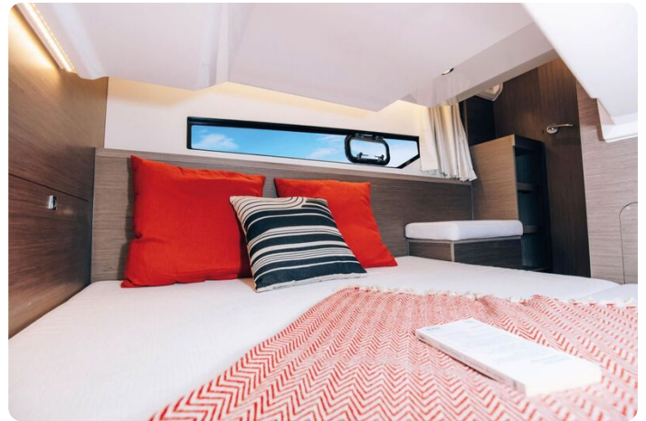
Jeanneau Merry Fisher 895 Sport - Series 2 - aft cabin