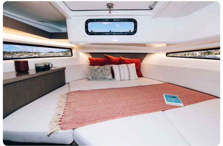
Jeanneau Merry Fisher 895 Sport - Series 2 - forward cabin