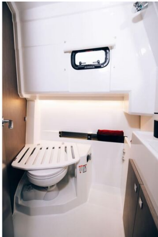
Jeanneau Merry Fisher 895 Sport - Series 2 - toilet and shower compartment