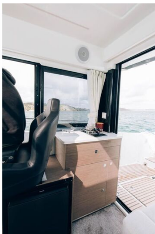
Jeanneau Merry Fisher 895 Sport - Series 2 - wheelhouse galley