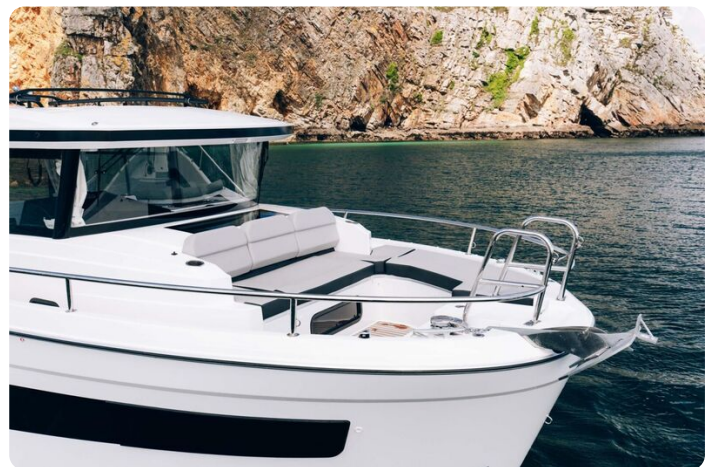
Jeanneau Merry Fisher 895 Sport - bow and pulpits rails