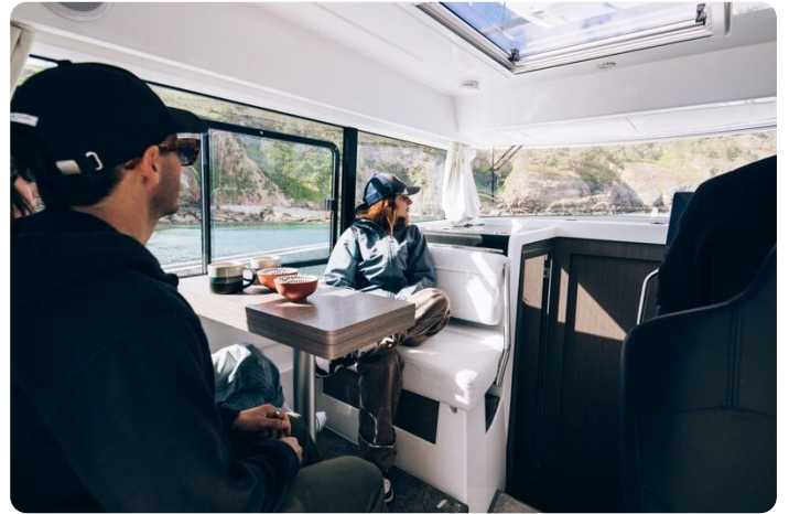
Jeanneau Merry Fisher 895 Sport - port side wheelhouse saloon