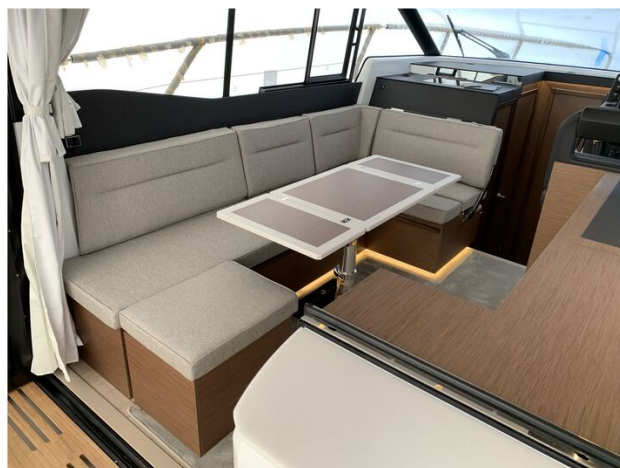
Jeanneau NC 37 twin diesel cruiser - wheelhouse saloon with U shape seating and table