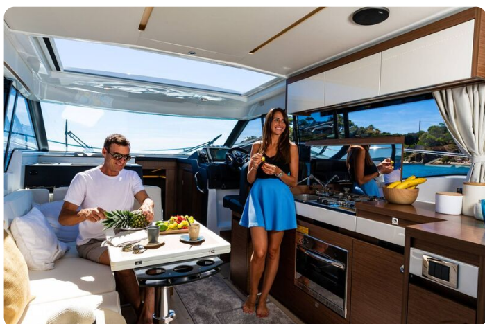
Jeanneau NC 37 twin diesel cruiser - wheelhouse saloon and galley