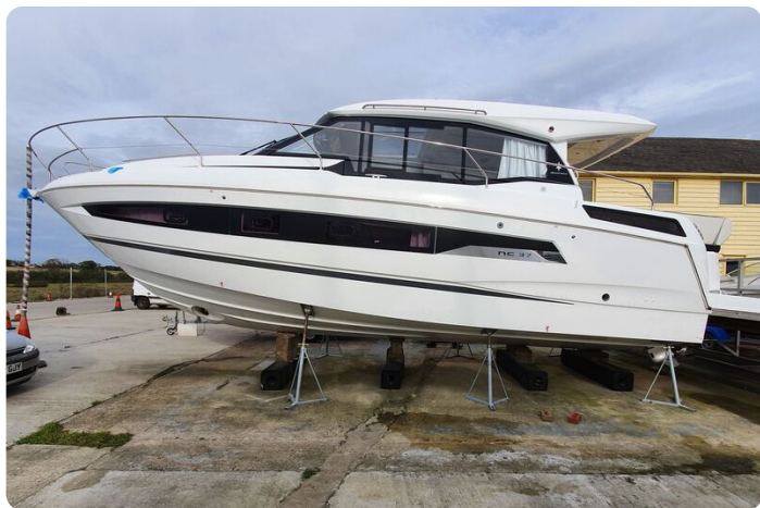
Jeanneau NC 37 twin diesel cruiser