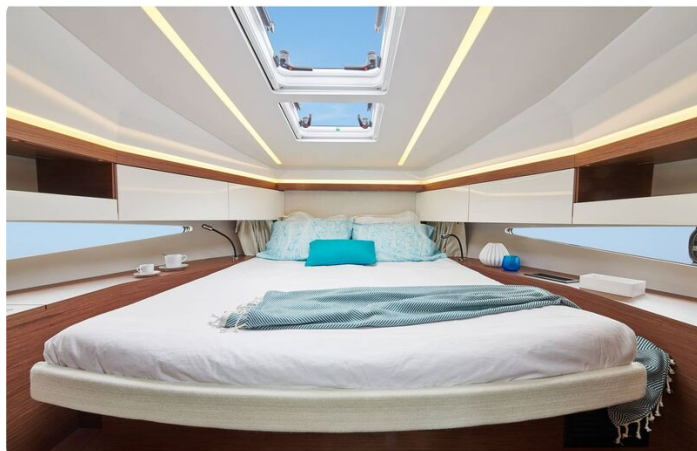
Jeanneau NC 37 twin diesel cruiser - double berth cabin