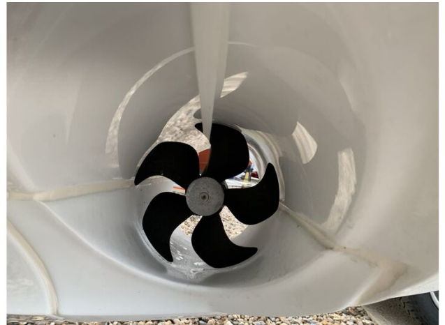
Jeanneau NC 37 twin diesel cruiser - bow thruster