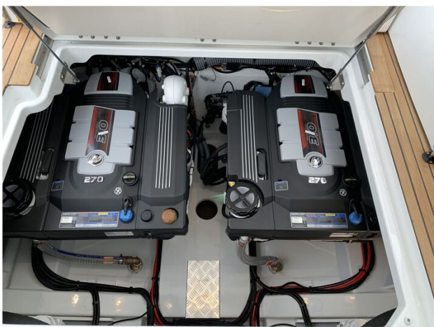
Jeanneau NC 37 twin diesel cruiser - 2x Mercruiser 270HP diesel inboards