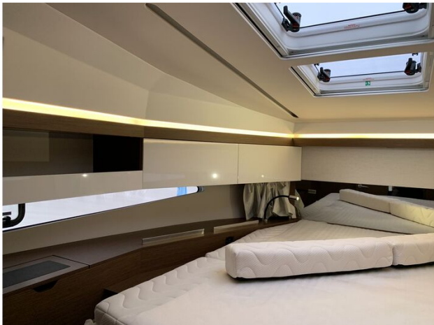
Jeanneau NC 37 twin diesel cruiser - main cabin with 2x hatch to deck