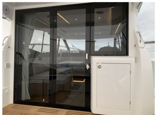
Jeanneau NC 37 twin diesel cruiser - wheelhouse doors