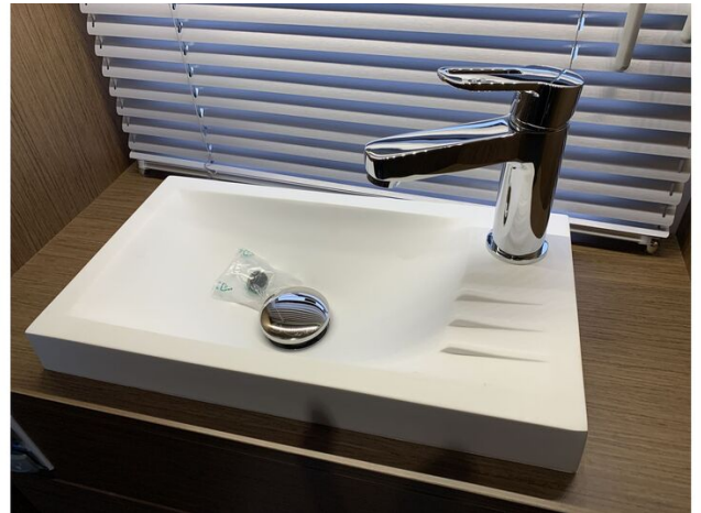
Jeanneau NC 37 twin diesel cruiser - sink in toilet compartment