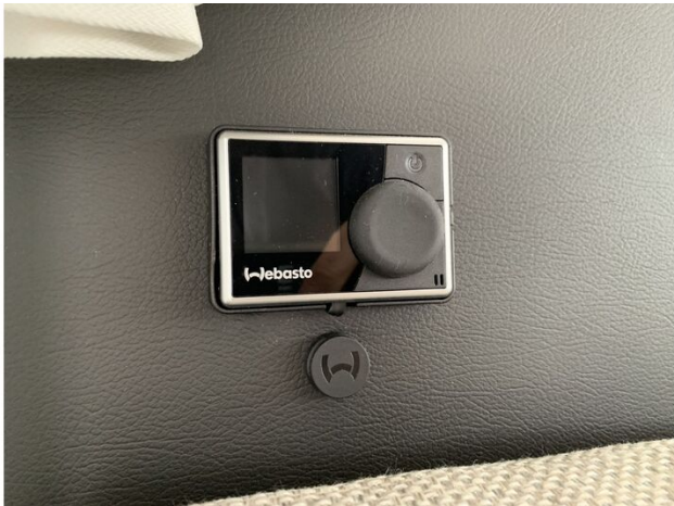
Jeanneau NC 37 twin diesel cruiser - Webasto heating controls