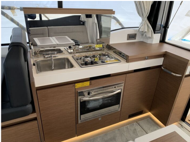
Jeanneau NC 37 twin diesel cruiser - galley with stove, oven and sink