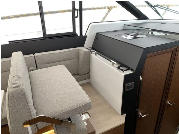
Jeanneau NC 37 twin diesel cruiser - copilot bench