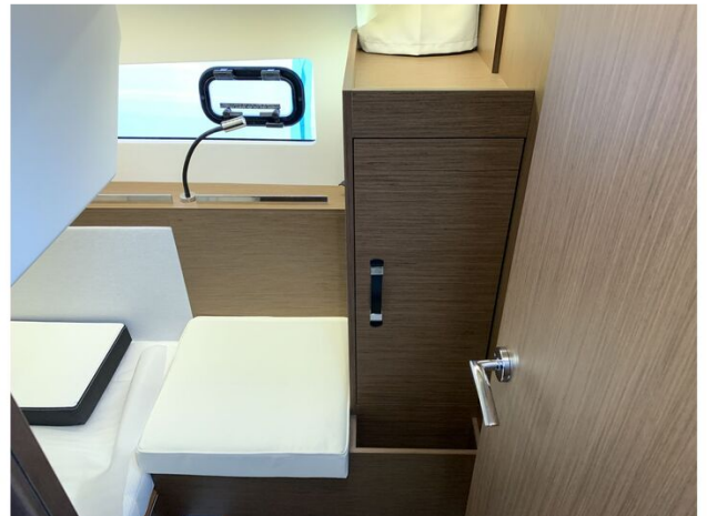
Jeanneau NC 37 twin diesel cruiser - 3rd cabin with berth and cupboard