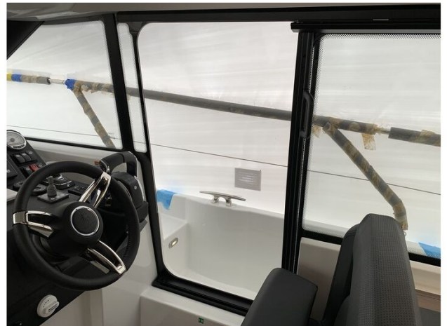
Jeanneau NC 37 twin diesel cruiser - helm side door