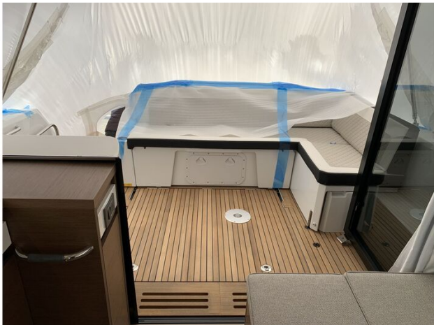
Jeanneau NC 37 twin diesel cruiser - aft sunpad