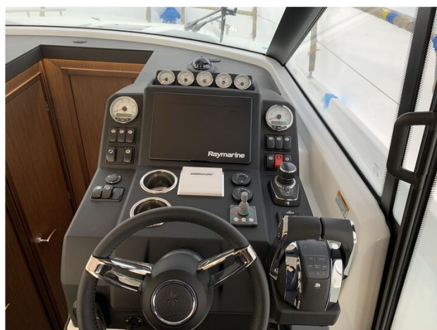
Jeanneau NC 37 twin diesel cruiser - engine controls