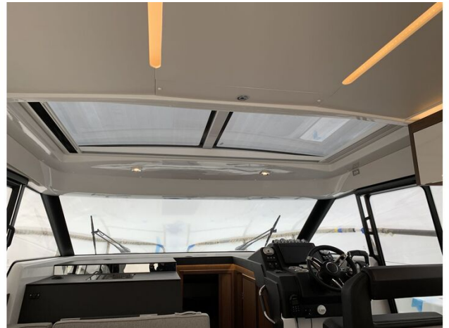
Jeanneau NC 37 twin diesel cruiser - electric sliding roof