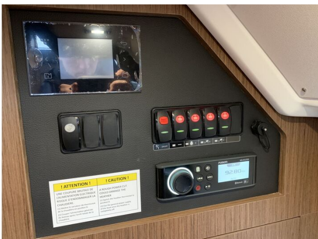
Jeanneau NC 37 twin diesel cruiser - audio controls and switch panel