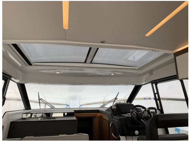
Jeanneau NC 37 twin diesel cruiser - electric sliding roof