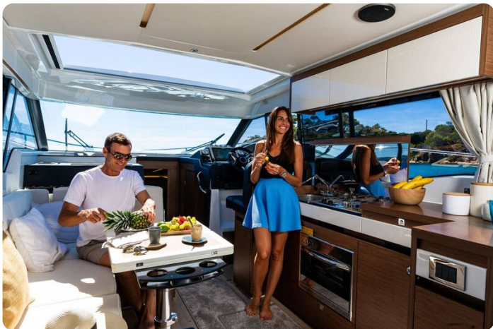
Jeanneau NC 37 twin diesel cruiser - wheelhouse saloon and galley