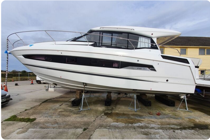
Jeanneau NC 37 twin diesel cruiser