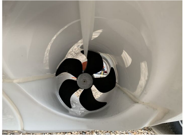
Jeanneau NC 37 twin diesel cruiser - bow thruster