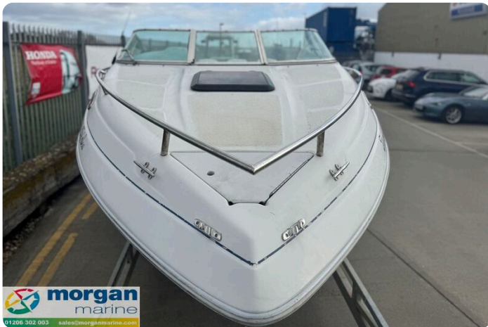
Mariah Shabah 218 - bow