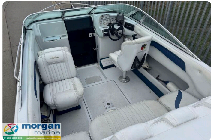
Mariah Shabah 218 - cockpit