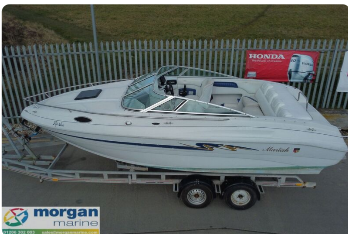
Mariah Shabah 218 - overview