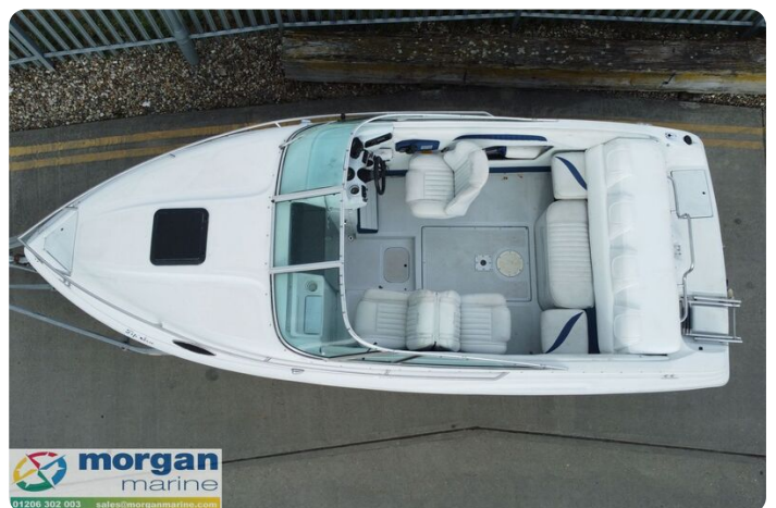
Mariah Shabah 218 - top view