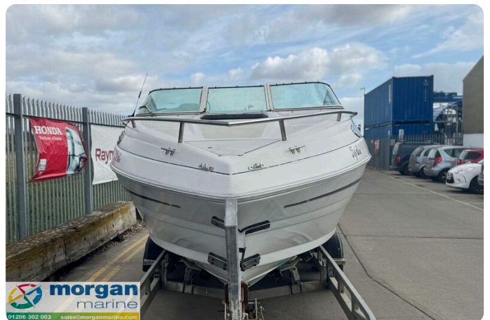
Mariah Shabah 218 - bow view