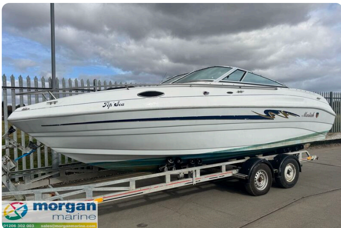
Mariah Shabah 218 - trailer