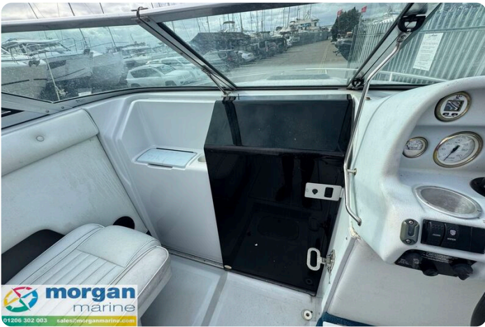
Mariah Shabah 218 - door