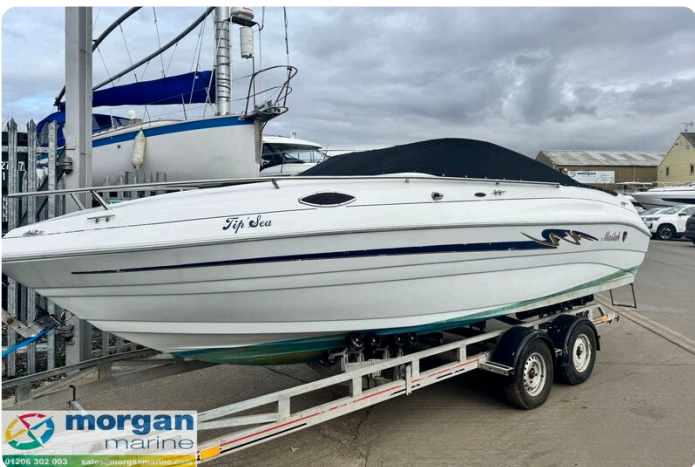
Mariah Shabah 218 - cover