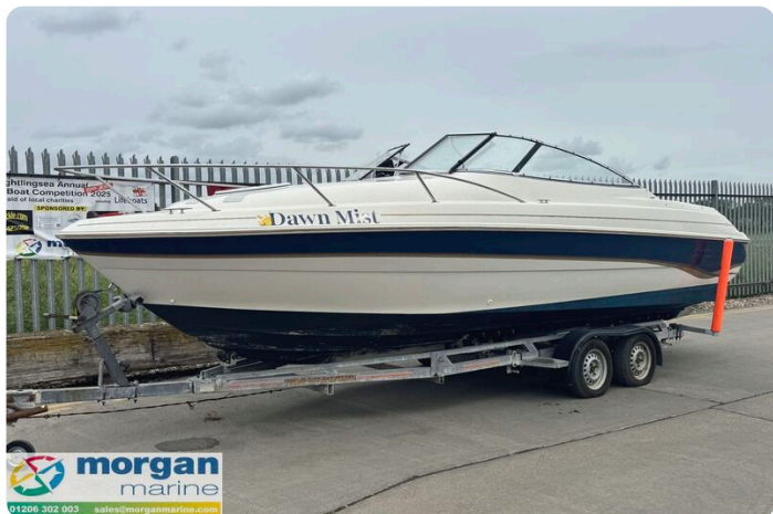
Monterey 236 - Main