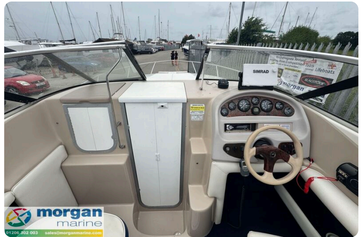
Monterey 236 - walk through