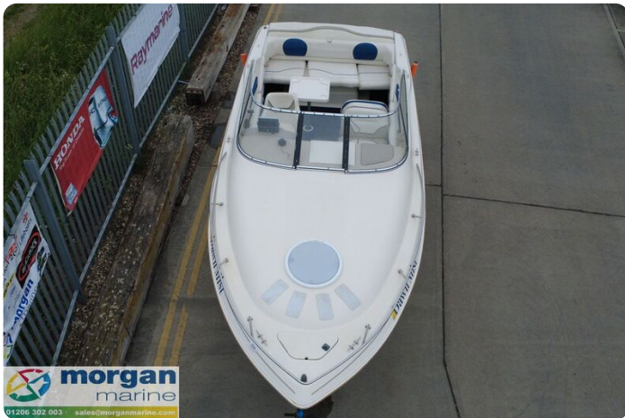
Monterey 236 - overview