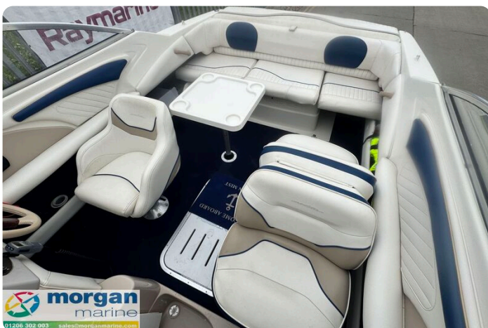
Monterey 236 - table