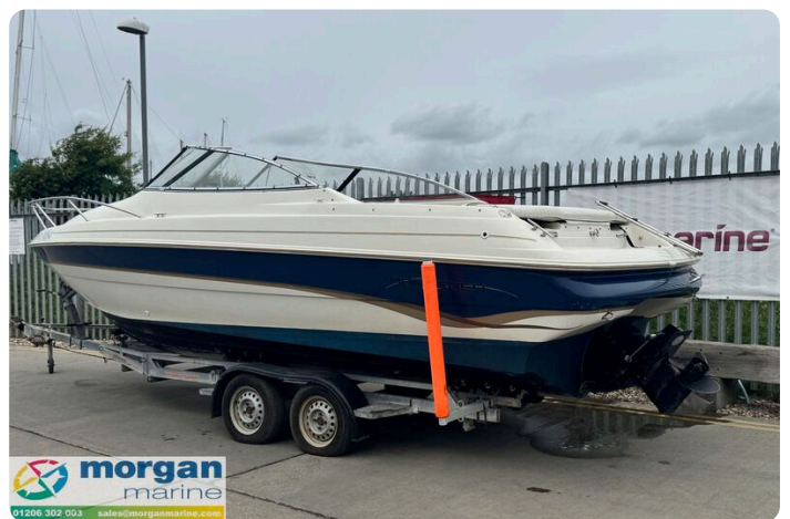
Monterey 236 - back view