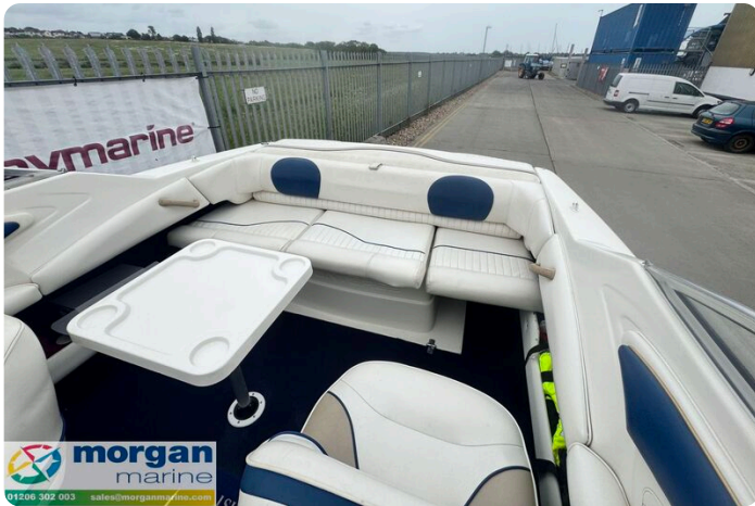
Monterey 236 - bench seat