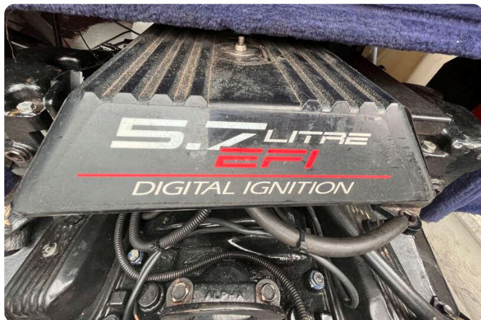
Monterey 236 - engine make