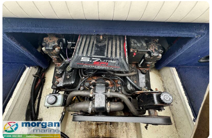
Monterey 236 - engine