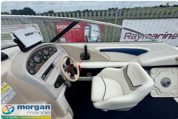
Monterey 236 - pilot seat