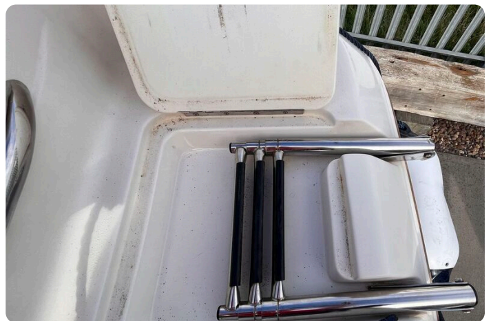
Monterey 236 - ladder folded up