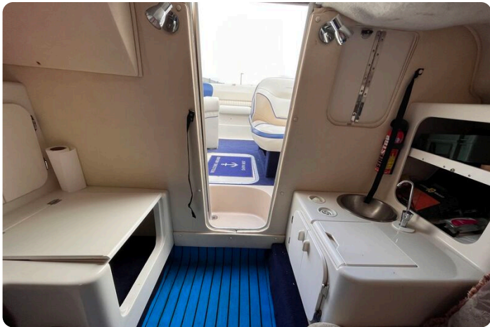
Monterey 236 - door