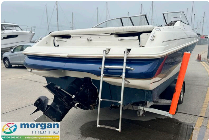
Monterey 236 - ladder