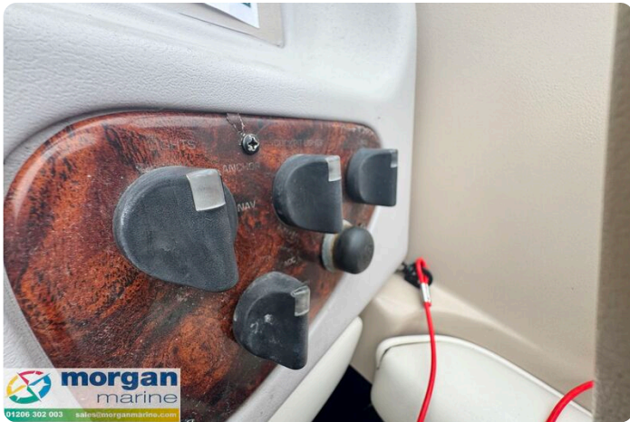
Monterey 236 - buttons