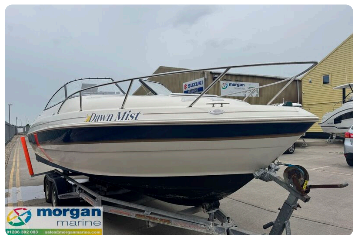
Monterey 236 - bow