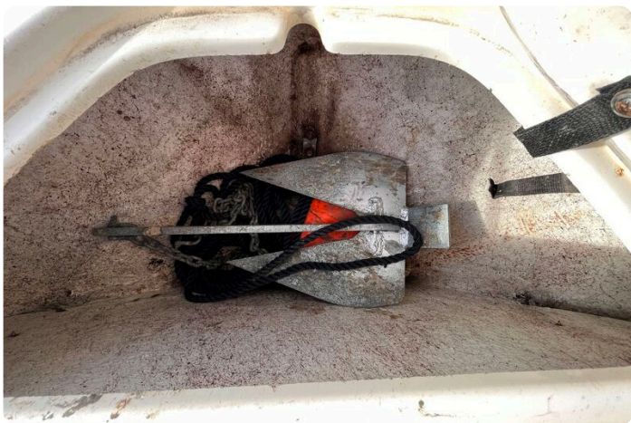
Monterey 236 - anchor