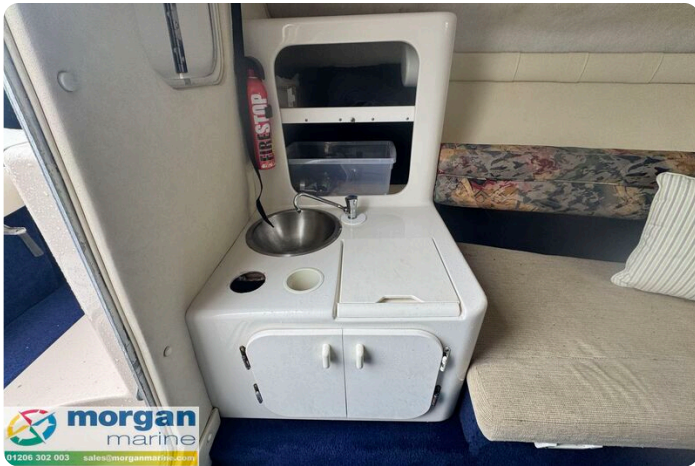
Monterey 236 - sink