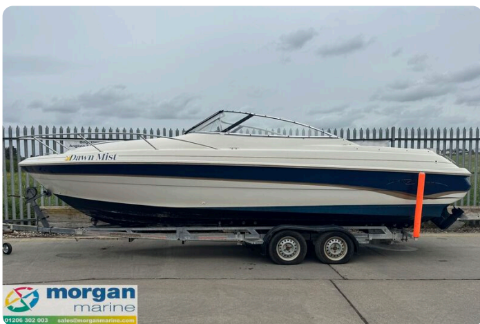
Monterey 236 - side on