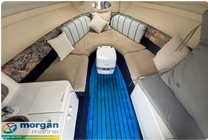
Monterey 236 - cabin