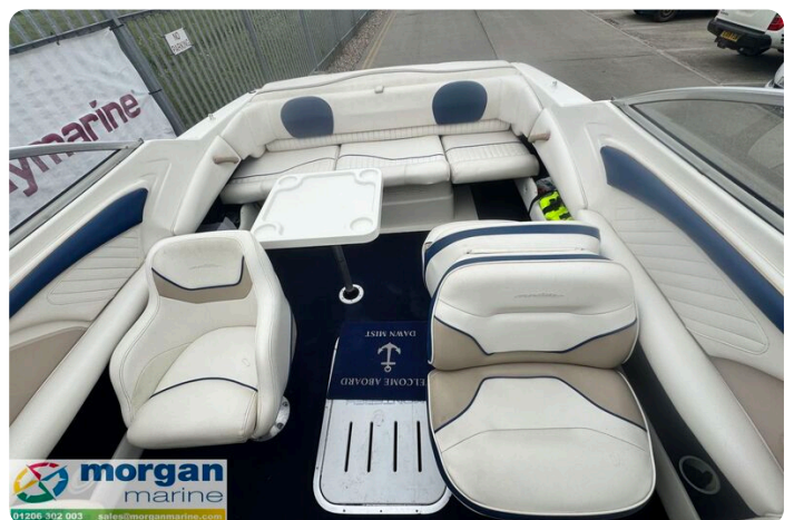
Monterey 236 - seats