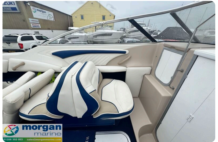
Monterey 236 - co pilot seat