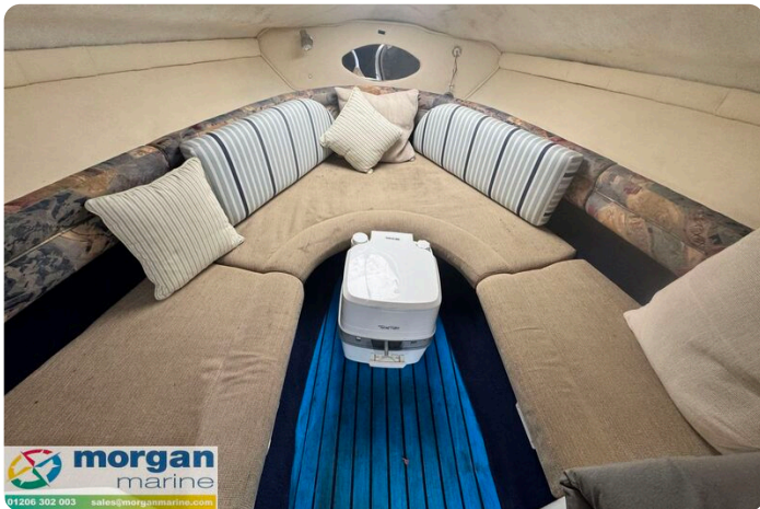
Monterey 236 - toilet