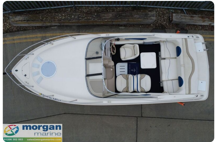
Monterey 236 - top view