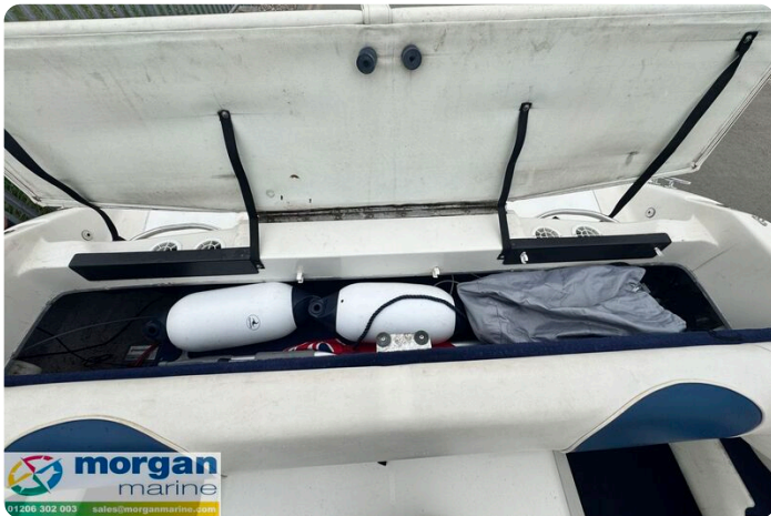
Monterey 236 - fenders