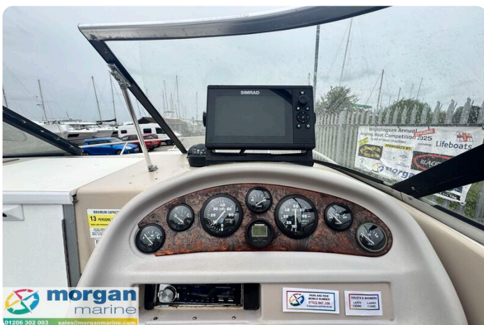
Monterey 236 - dash