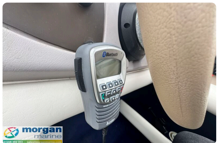
Monterey 236 - VHF