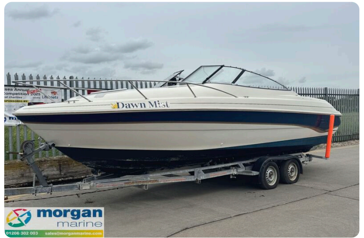
Monterey 236 - side