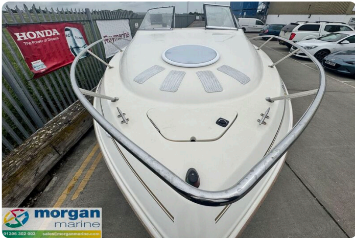
Monterey 236 - bow view