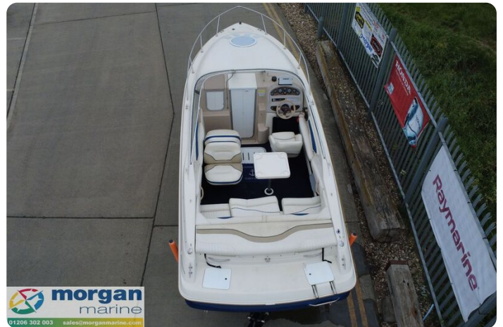
Monterey 236 - overview stern