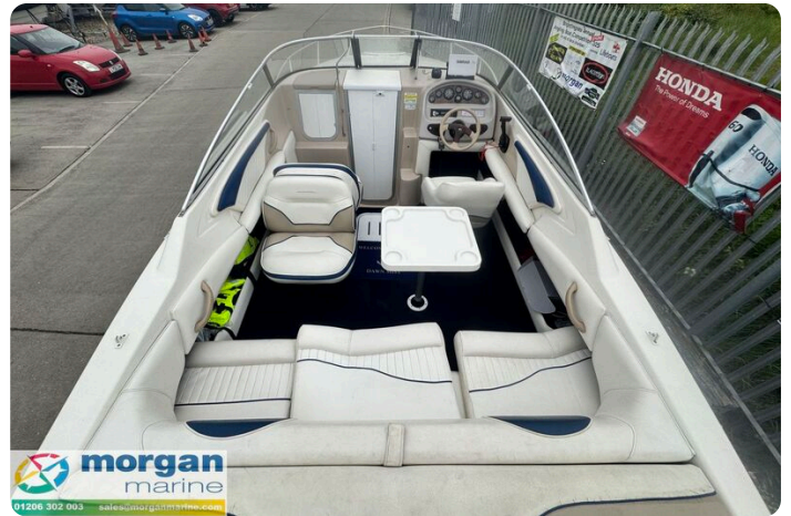
Monterey 236 - cockpit