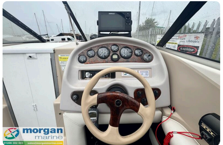
Monterey 236 - wheel