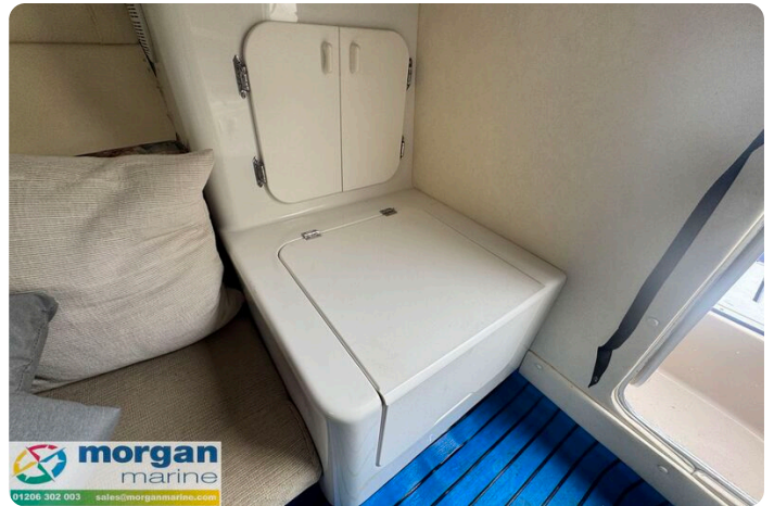
Monterey 236 - cabin storage