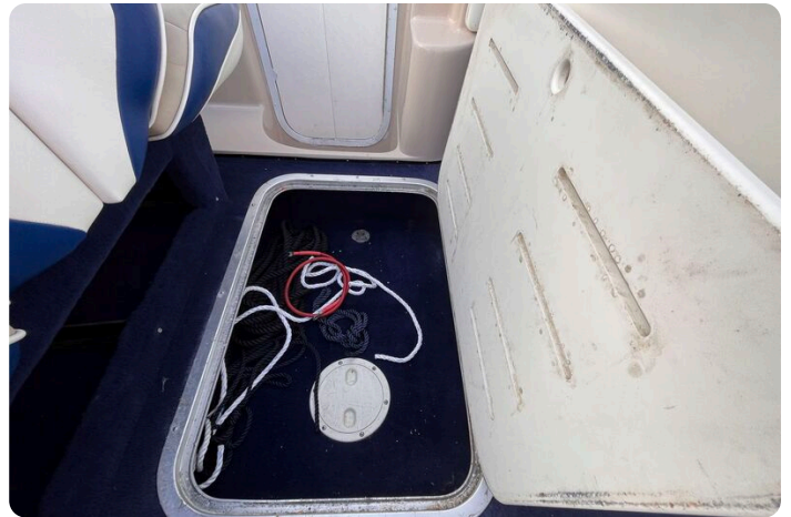
Monterey 236 - locker