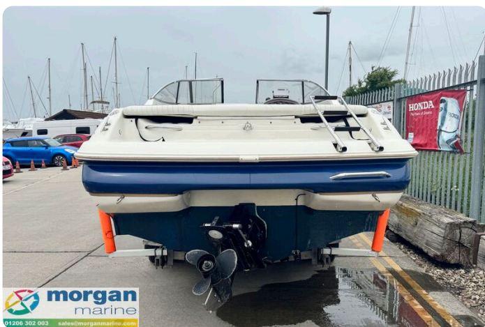
Monterey 236 - stern