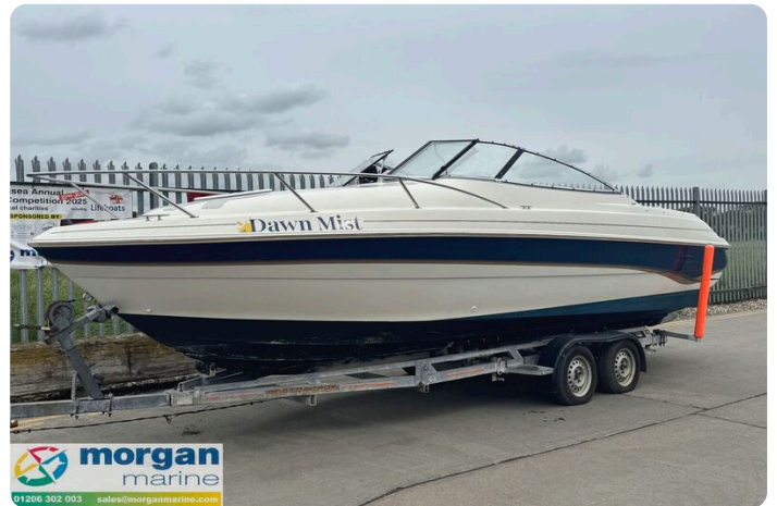
Monterey 236 - side