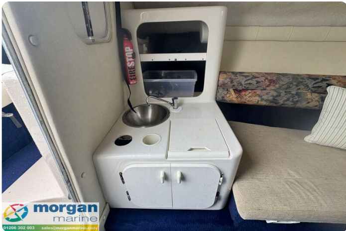
Monterey 236 - sink