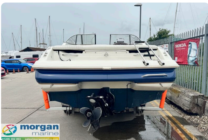
Monterey 236 - stern