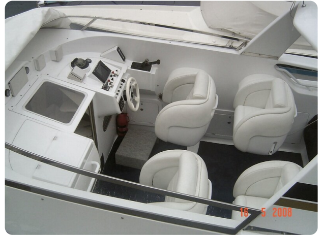
Monte Carlo 17