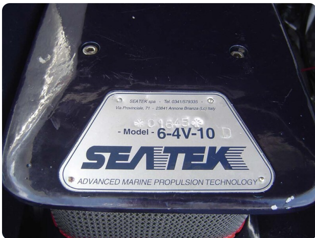
Monte Carlo 17