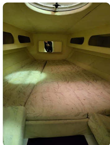
Monte Carlo 7