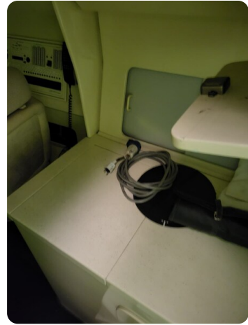
Monte Carlo 9