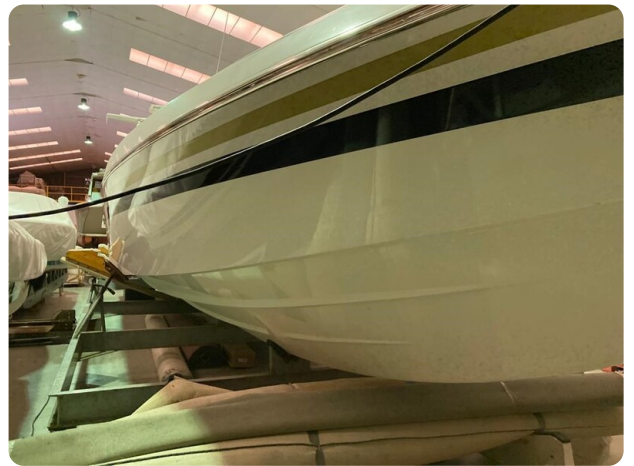
Monte Carlo 13