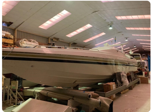
Monte Carlo 12