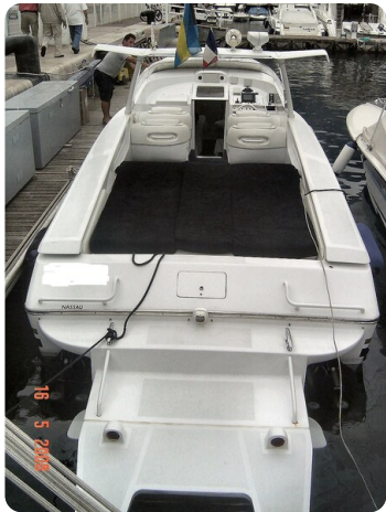
Monte Carlo 15a