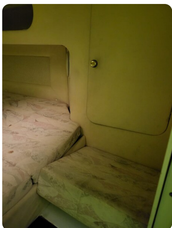
Monte Carlo 6