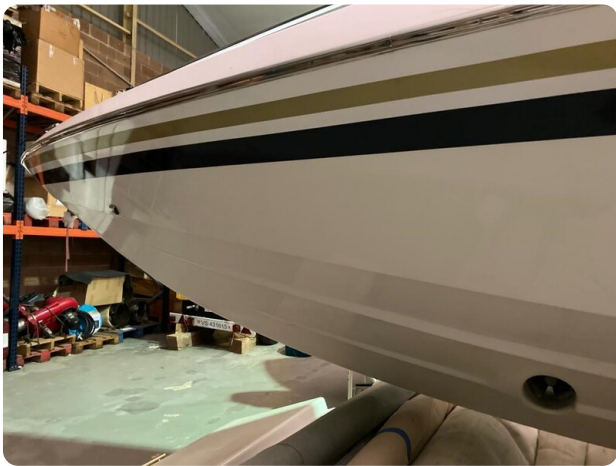
Monte Carlo 11