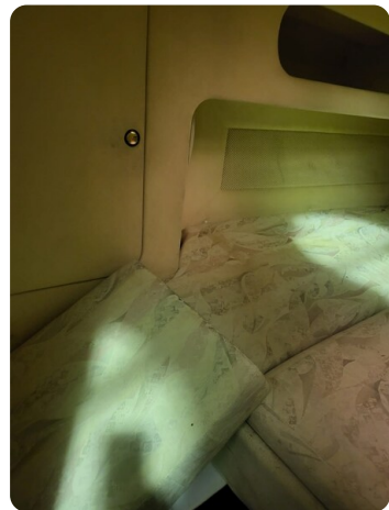
Monte Carlo 5