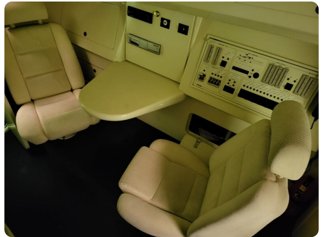
Monte Carlo 4