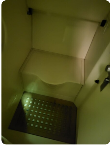
Monte Carlo 8