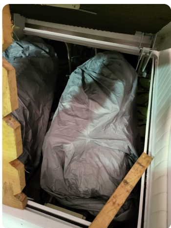
Monte Carlo 3