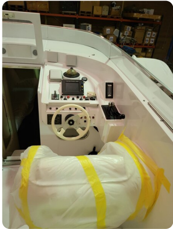
Monte Carlo 1