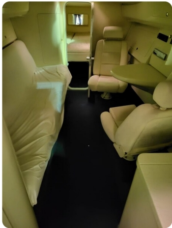
Monte Carlo 10