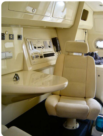
Monte Carlo 16