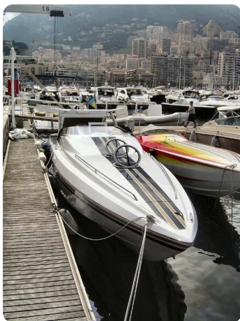
Monte Carlo 14