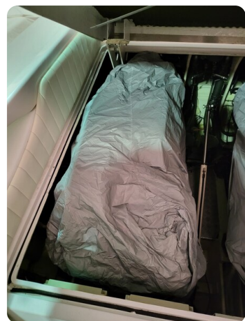
Monte Carlo 2