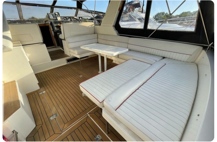
Princess 36 Riviera-Cockpit