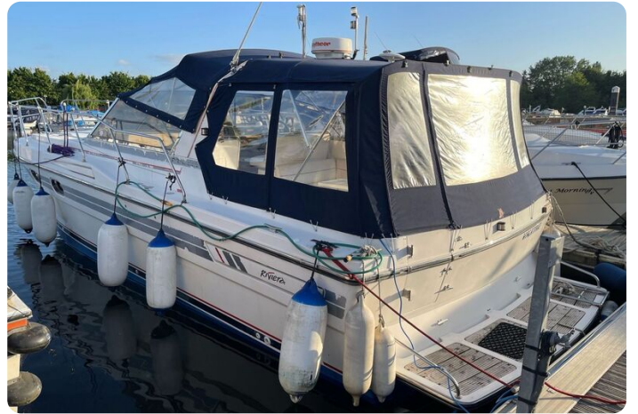
Princess 36 Riviera-stern