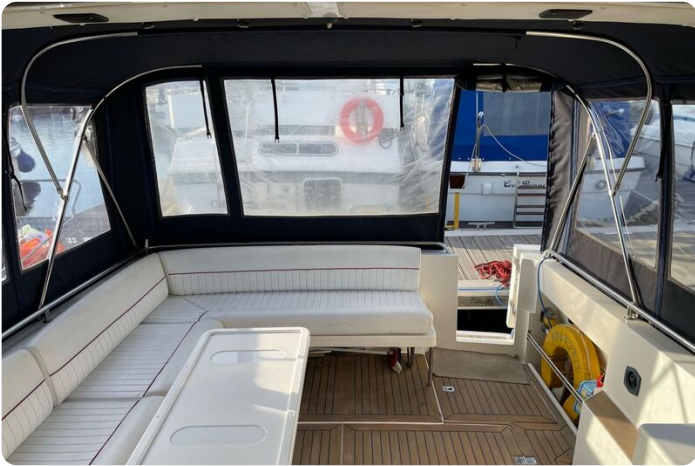
Princess 36 Riviera-seating