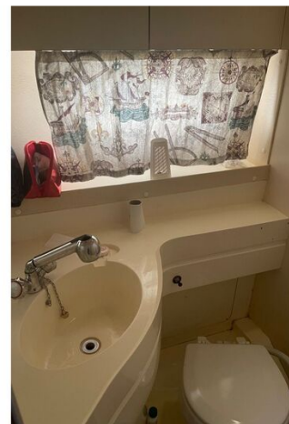
Princess 36 Riviera-toilet