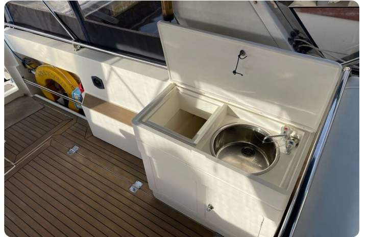
Princess 36 Riviera-cockpit-sink