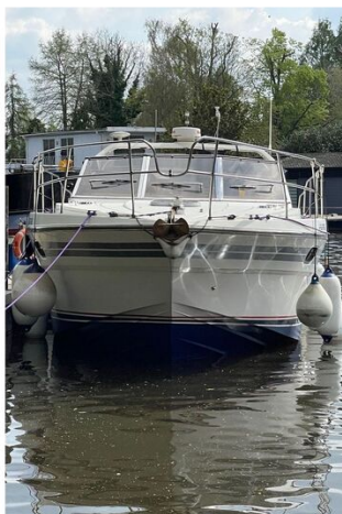
Princess 36 Riviera-front