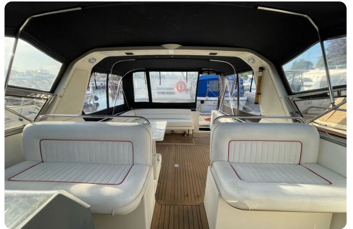
Princess 36 Riviera-overview