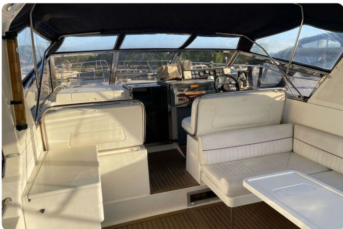
Princess 36 Riviera-cockpit