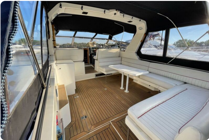
Princess 36 Riviera-cockpit-table