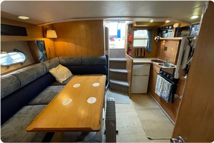
Princess 36 Riviera-saloon-seating