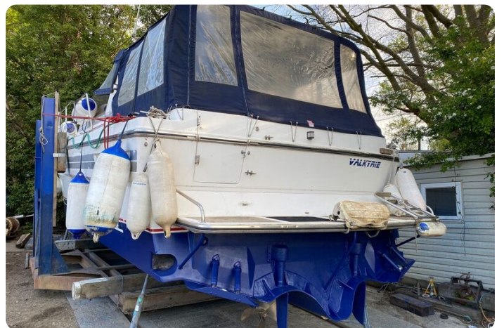
Princess 36 Riviera-back