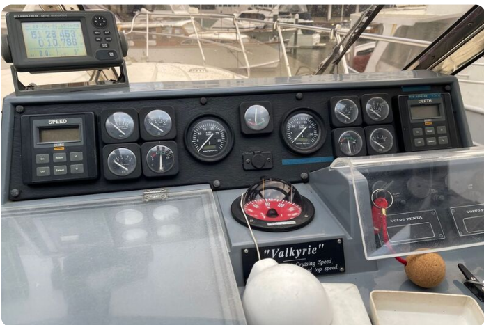
Princess 36 Riviera-dash