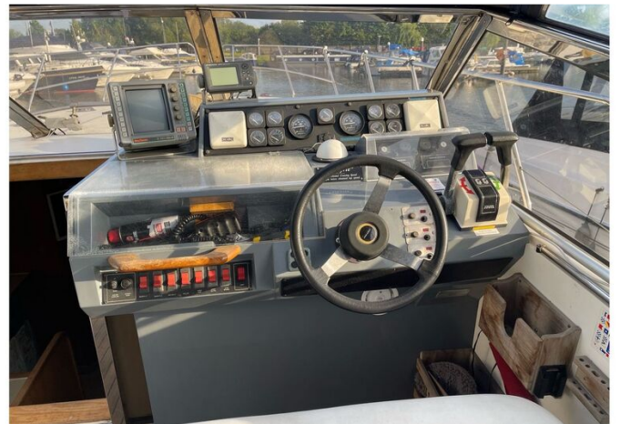
Princess 36 Riviera-dash