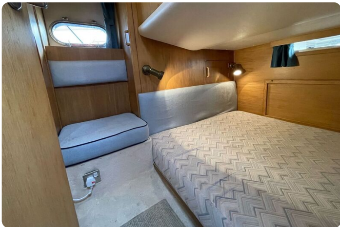
Princess 36 Riviera-aft-berth