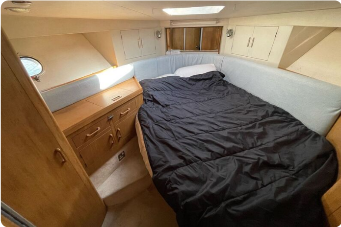
Princess 36 Riviera-berth