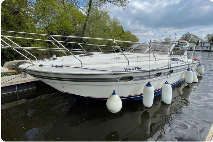
Princess 36 Riviera