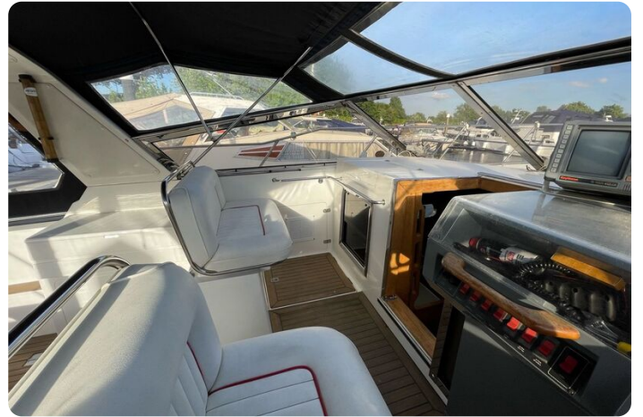
Princess 36 Riviera-co-pilot-seating