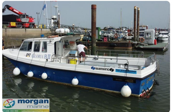
Procharter 36 GRP charter fishing boat - in the cockpit