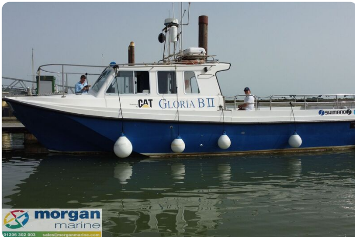
Procharter 36 GRP charter fishing boat - port side view of wheelhouse