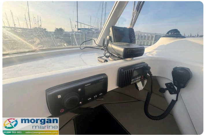
Quicksilver 640 - fusion