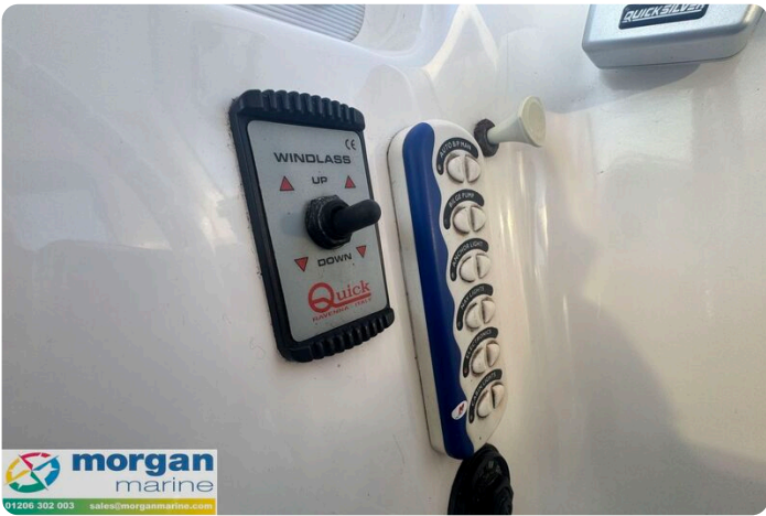
Quicksilver 640 - windlass