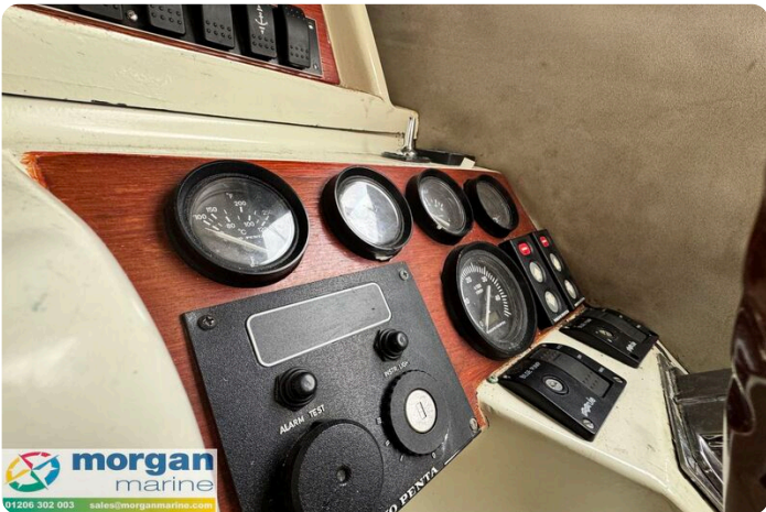
Relcraft Diamond Sedan 30 - gauges