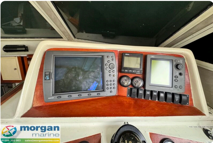
Relcraft Diamond Sedan 30 - plotters