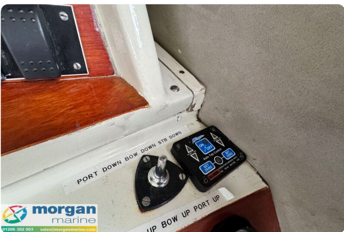
Relcraft Diamond Sedan 30 - trim tab controls