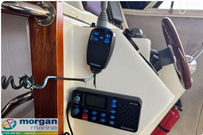
Relcraft Diamond Sedan 30 - vhf radio