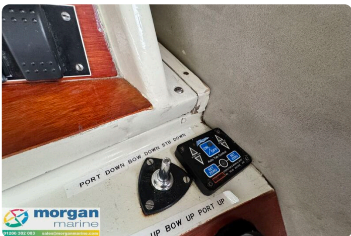
Relcraft Diamond Sedan 30 - trim tab controls