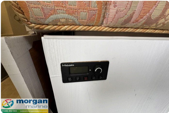
Relcraft Diamond Sedan 30 - heating