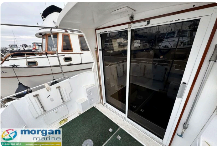
Relcraft Diamond Sedan 30 - cockpit doors