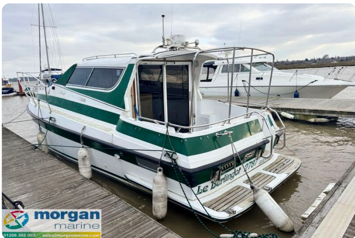
Relcraft Diamond Sedan 30 - fenders