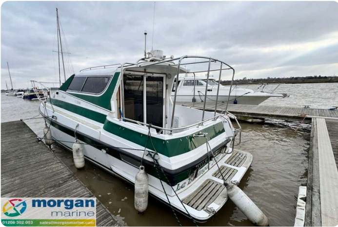
Relcraft Diamond Sedan 30 - bathing