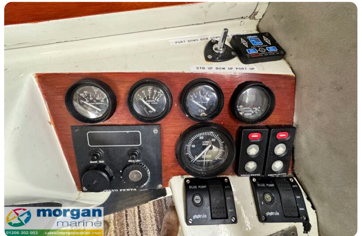
Relcraft Diamond Sedan 30 - trim tabs