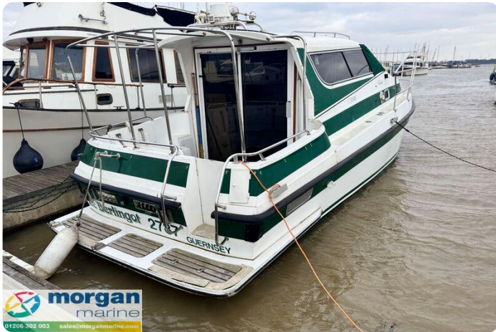
Relcraft Diamond Sedan 30 - back