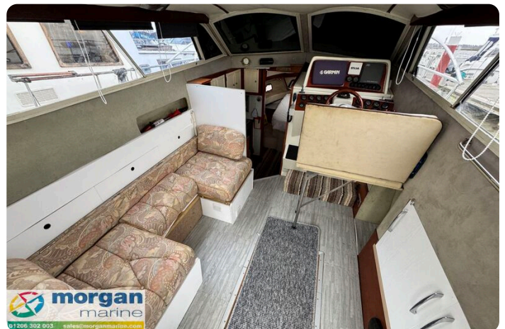
Relcraft Diamond Sedan 30 - saloon