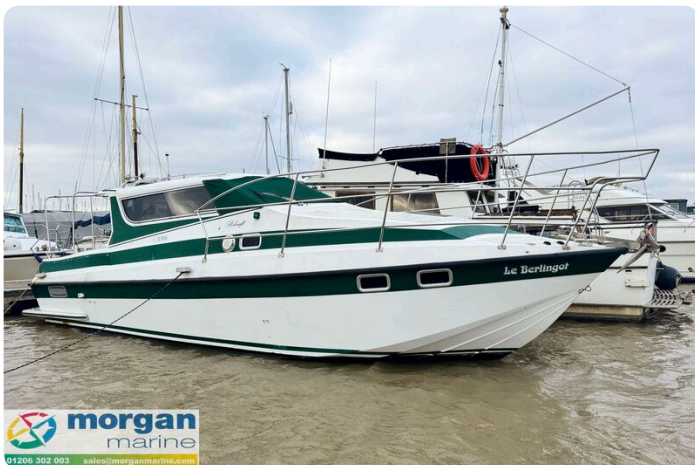
Relcraft Diamond Sedan 30 - main