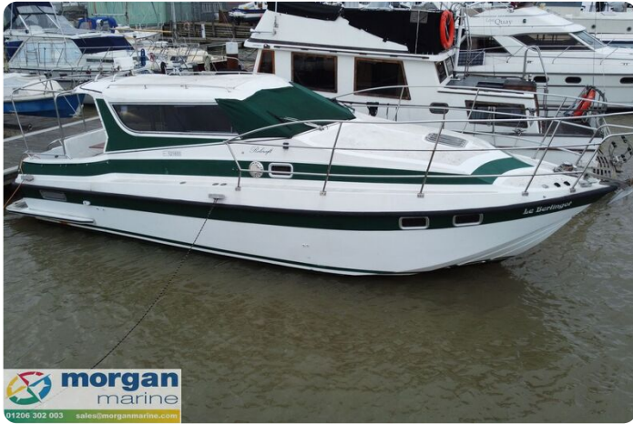
Relcraft Diamond Sedan 30 - rails