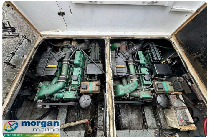
Relcraft Diamond Sedan 30 - engine