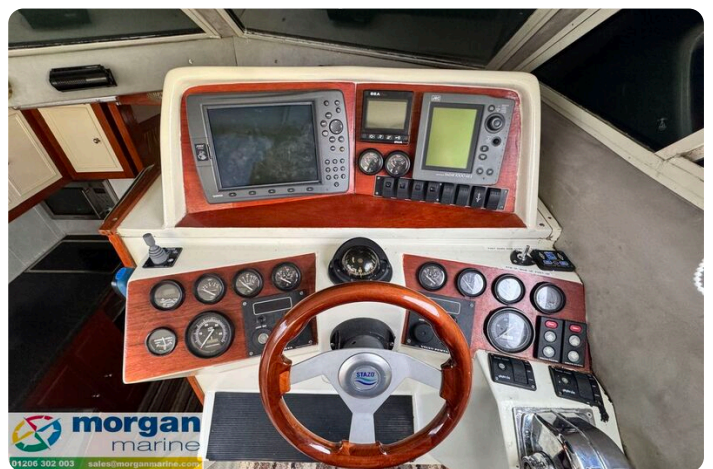
Relcraft Diamond Sedan 30 - wheel