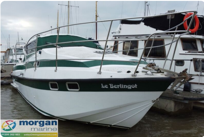
Relcraft Diamond Sedan 30 - bow view