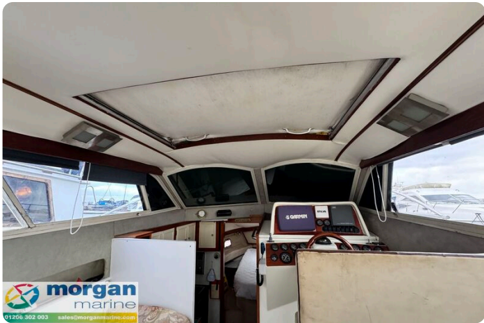
Relcraft Diamond Sedan 30 - hatch