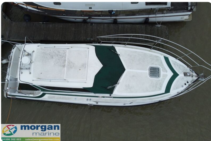
Relcraft Diamond Sedan 30 - top -view