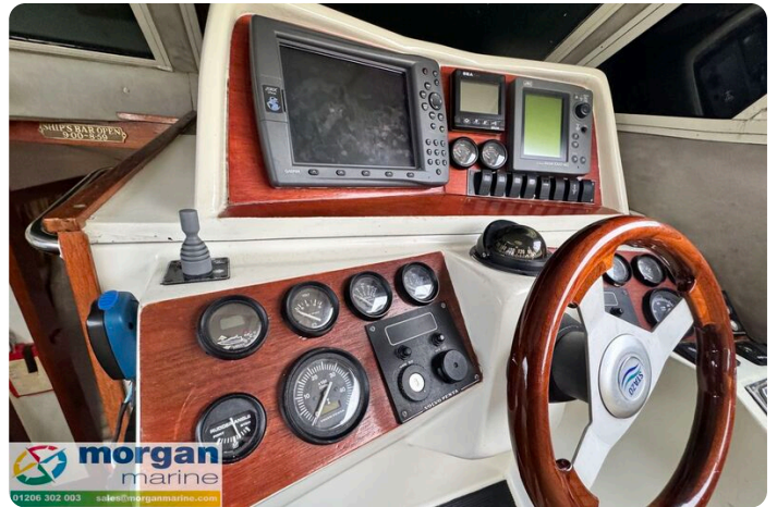
Relcraft Diamond Sedan 30 - bow thruster