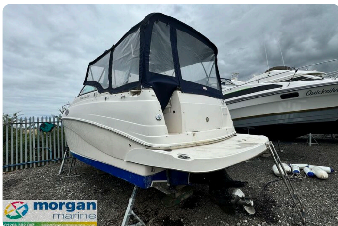
Rinker fiesta vee 250 boat - bathing platform and entrance to cockpit