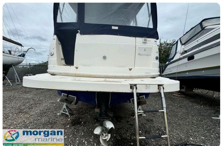
Rinker fiesta vee 250 boat - transom