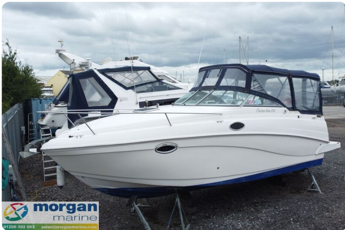
Rinker fiesta vee 250 boat - pulpit