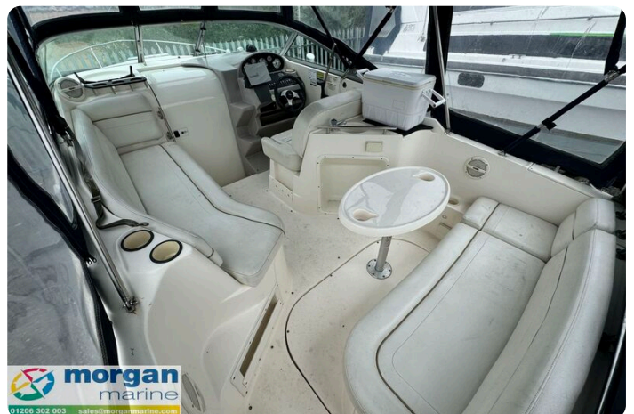
Rinker fiesta vee 250 boat - cockpit seating and table