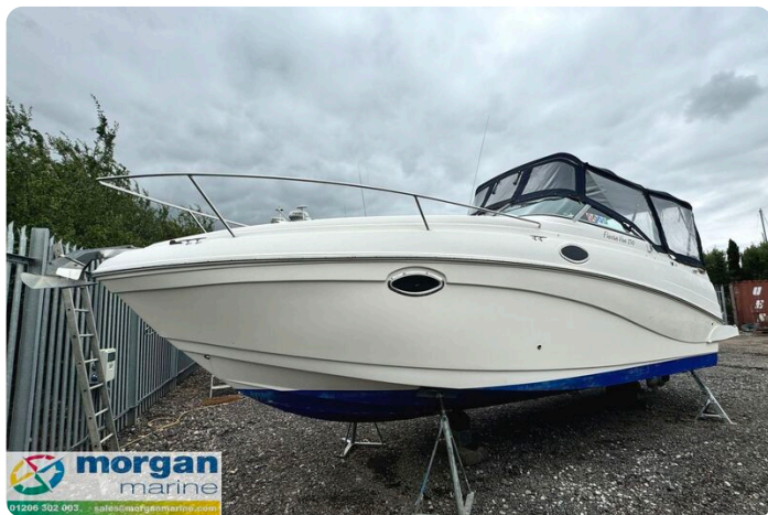
Rinker fiesta vee 250 boat