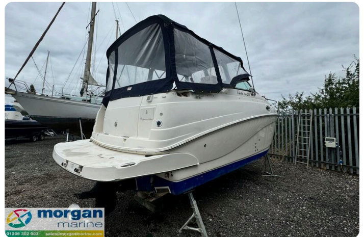
Rinker fiesta vee 250 boat - aft platform