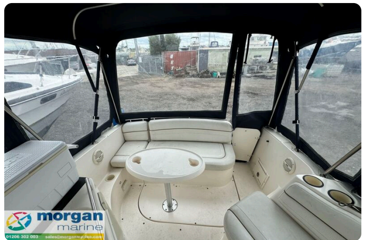
Rinker fiesta vee 250 boat - view from cockpit through aft canopy