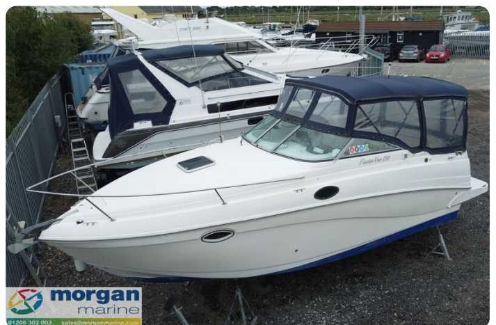
Rinker fiesta vee 250 boat - bow area