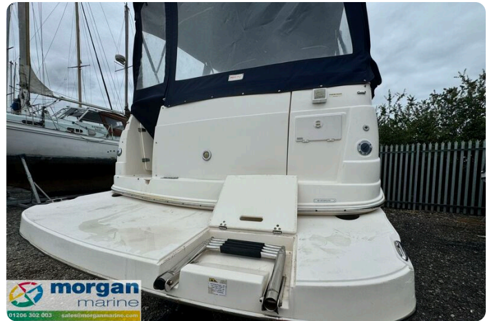
Rinker fiesta vee 250 boat - folding boarding ladder