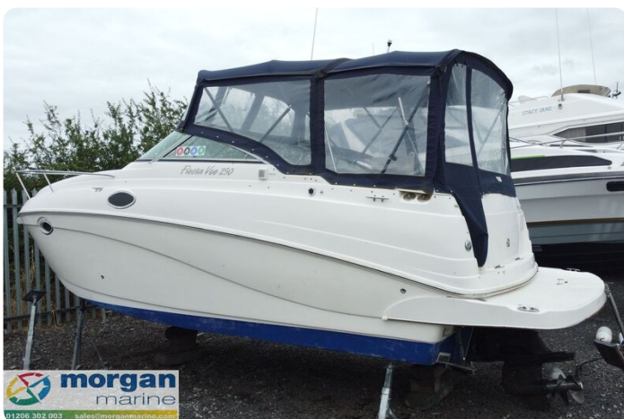
Rinker fiesta vee 250 boat - port side