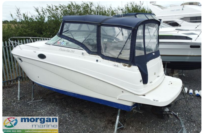
Rinker fiesta vee 250 boat - aft canopy