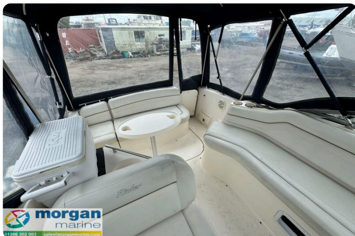
Rinker fiesta vee 250 boat - cockpit seating from helm