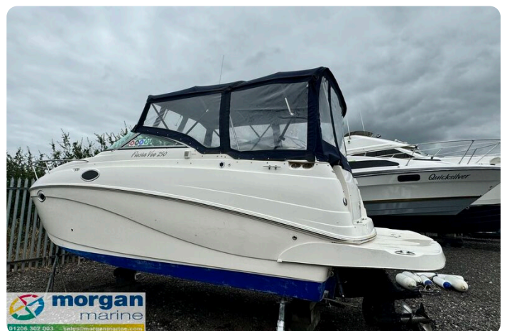
Rinker fiesta vee 250 boat - port side canopy