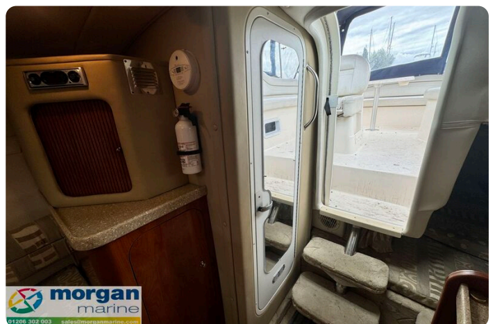
Rinker fiesta vee 250 boat - steps to cockpit