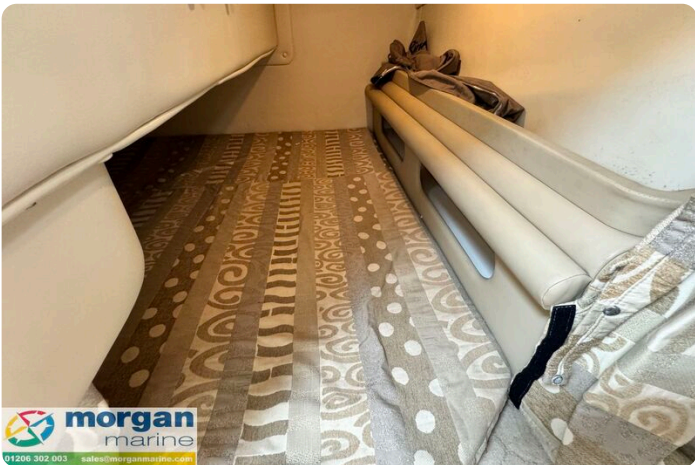
Rinker fiesta vee 250 boat - aft berth mattress