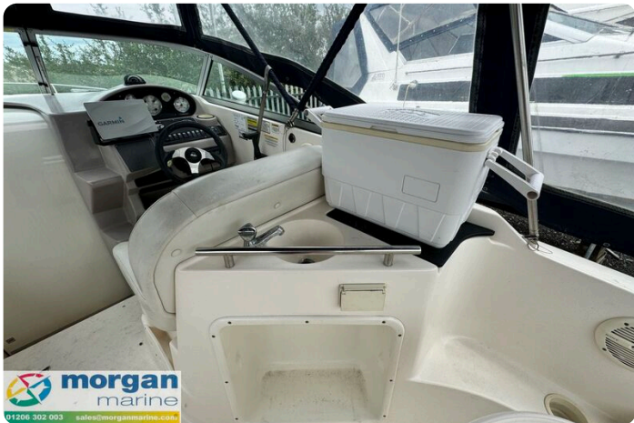
Rinker fiesta vee 250 boat - cockpit sink