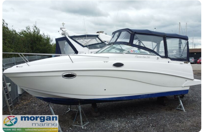
Rinker fiesta vee 250 boat - port side bow