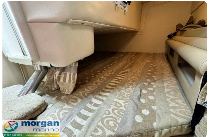
Rinker fiesta vee 250 boat - aft berth