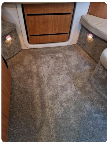
Sea Ray 375 Sundancer Twin Diesel