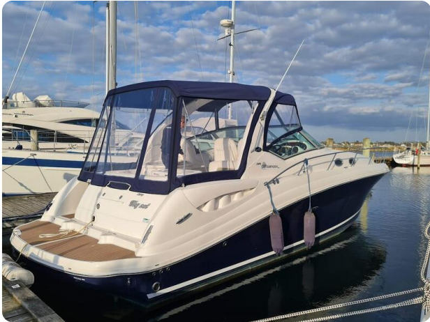
Sea Ray 375 Sundancer Twin Diesel