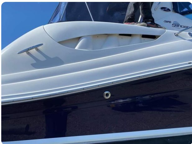
Sea Ray 375 Sundancer Twin Diesel