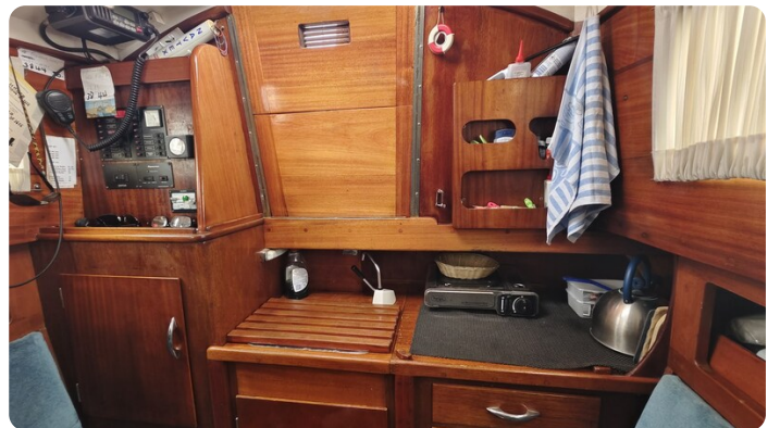
Malö 50_msp776556 24