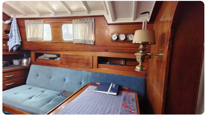
Malö 50_msp776556 27