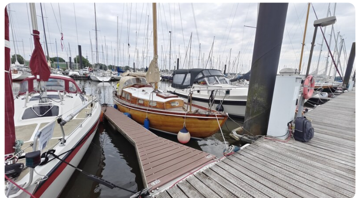
Malö 50_msp776556 48