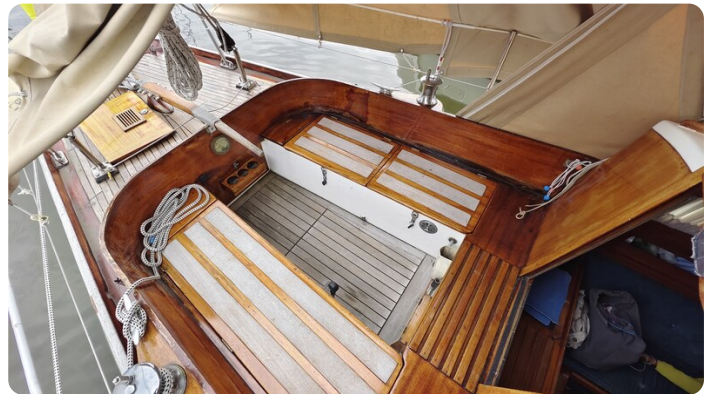
Malö 50_msp776556 36