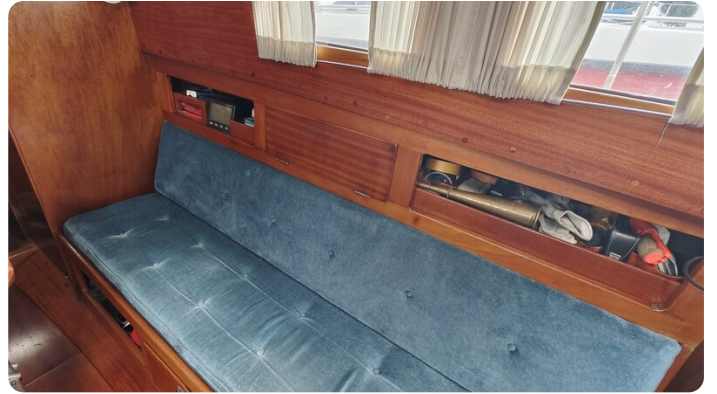
Malö 50_msp776556 17