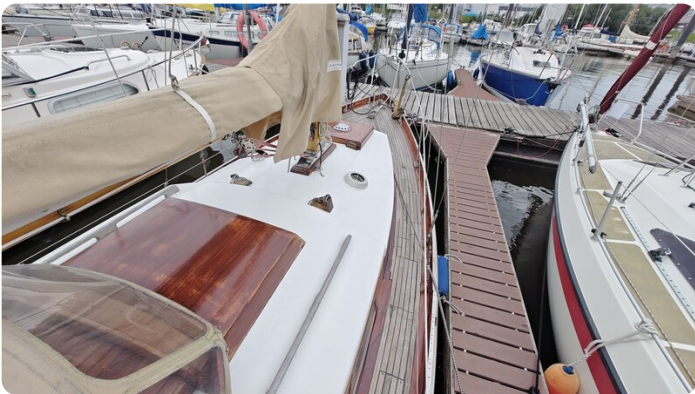
Malö 50_msp776556 42