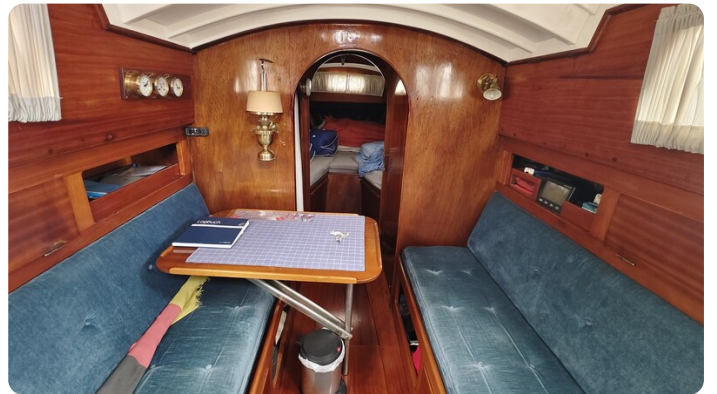
Malö 50_msp776556 19