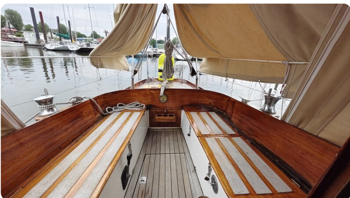
Malö 50_msp776556 35