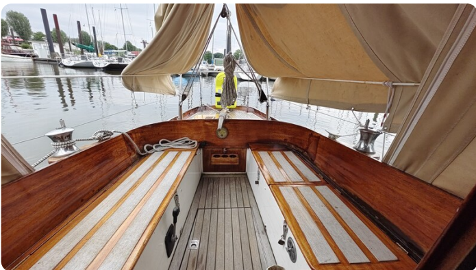
Malö 50_msp776556 35