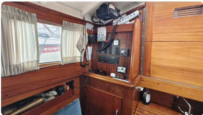
Malö 50_msp776556 20