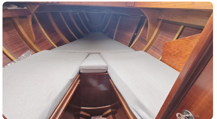
Malö 50_msp776556 2