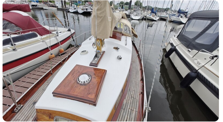
Malö 50_msp776556 45