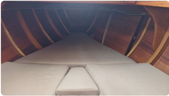
Malö 50_msp776556 4