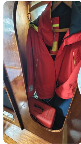
Malö 50_msp776556 12