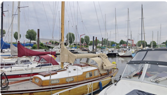
Malö 50_msp776556 49