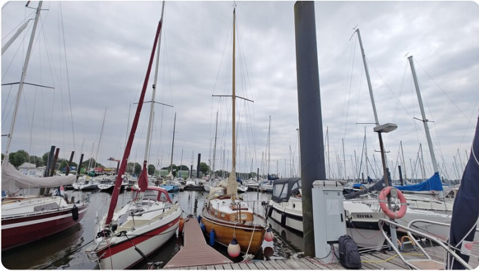
Malö 50_msp776556 47