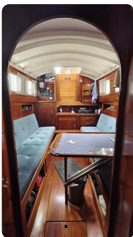
Malö 50_msp776556 11