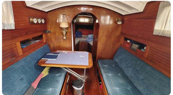
Malö 50_msp776556 19