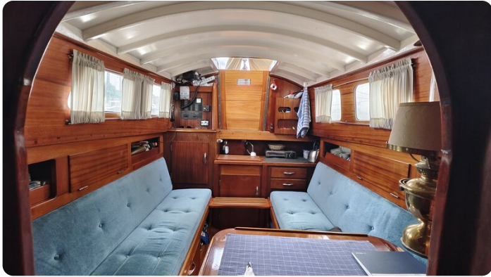
Malö 50_msp776556 16