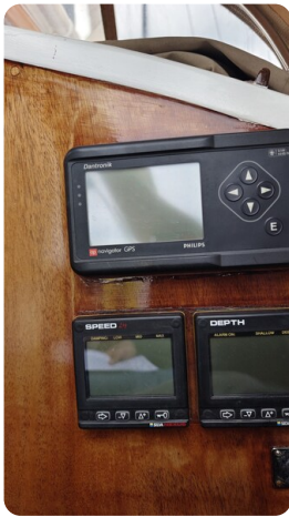
Malö 50_msp776556 30