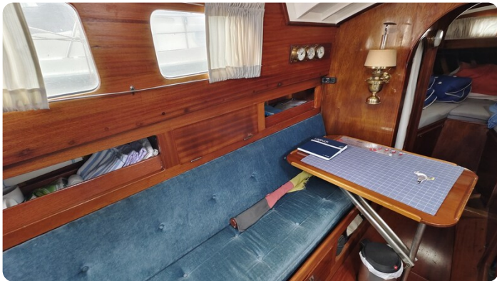
Malö 50_msp776556 18