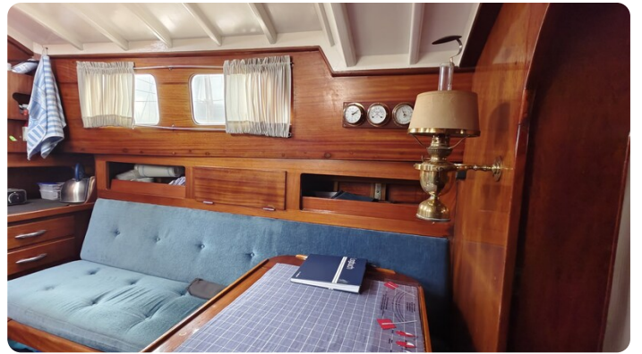
Malö 50_msp776556 27