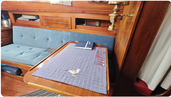
Malö 50_msp776556 25