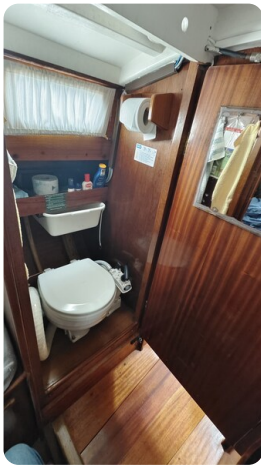
Malö 50_msp776556 8