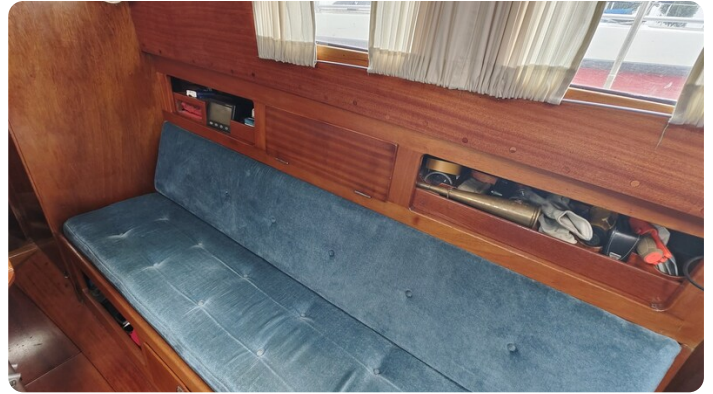
Malö 50_msp776556 17