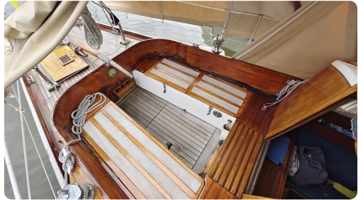
Malö 50_msp776556 36