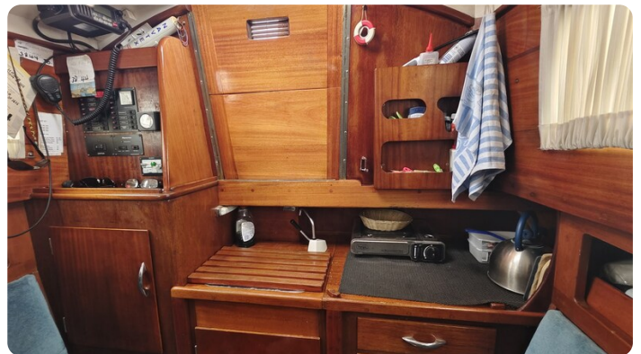
Malö 50_msp776556 24