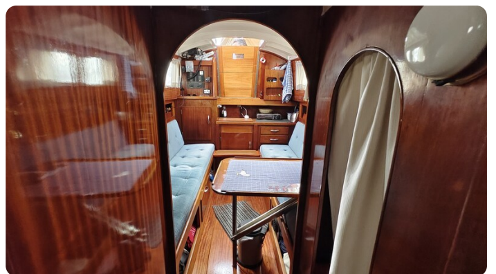
Malö 50_msp776556 13