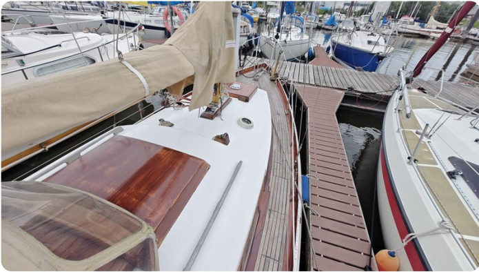
Malö 50_msp776556 42