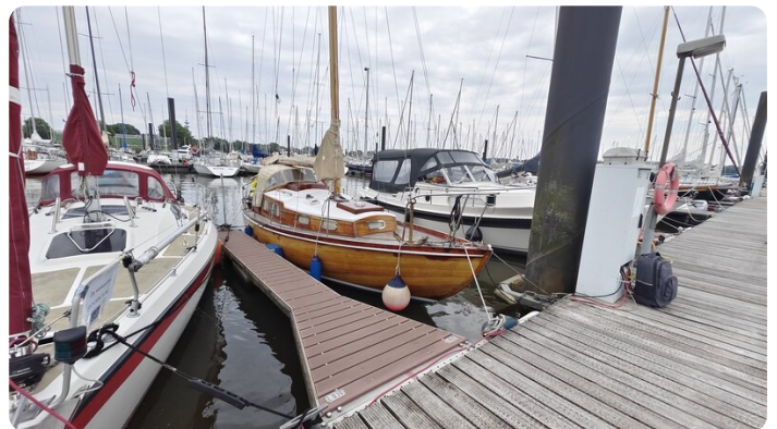
Malö 50_msp776556 48