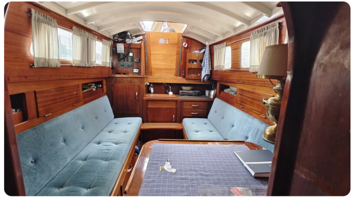
Malö 50_msp776556 1