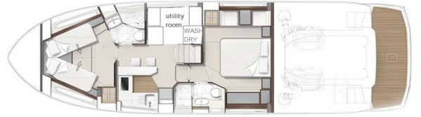
PRED50 lower deck w. utility room