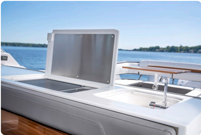
Tiara 43 LS galley