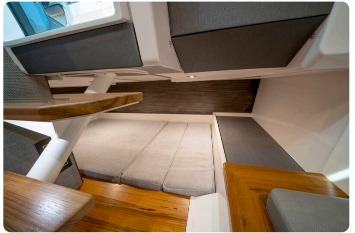
Tiara 43 LS aft berth