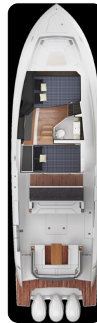
Tiara 43 LS interior layout