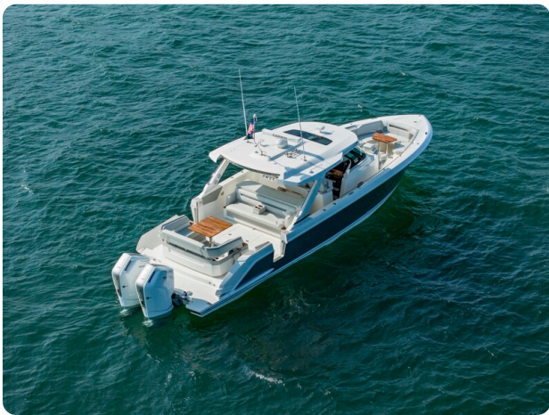
Tiara 43LS aerial