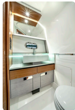
Tiara 43LS head