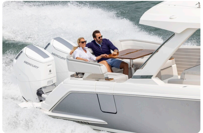
Tiara 43LS details