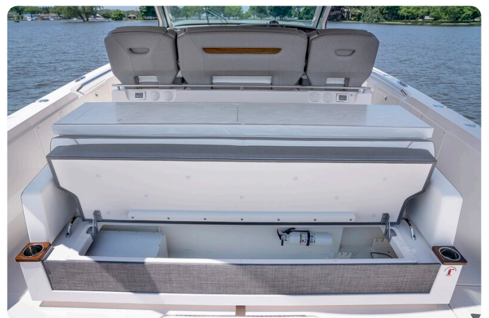
Tiara 43 LS aft storage