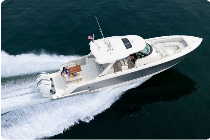
Tiara 43LS aerial view