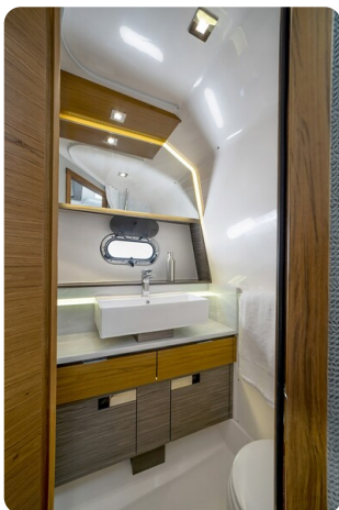
Tiara 43 LS bathroom