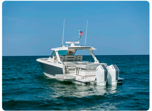
Tiara 43LS aft view