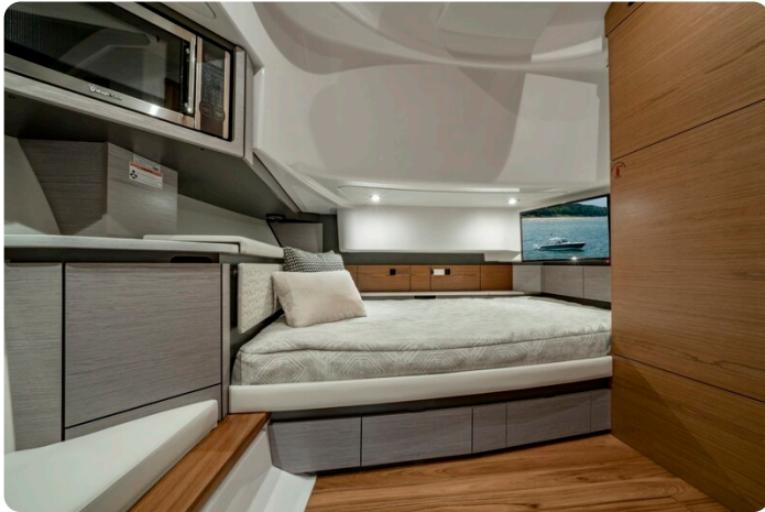
Tiara 43LS cabin