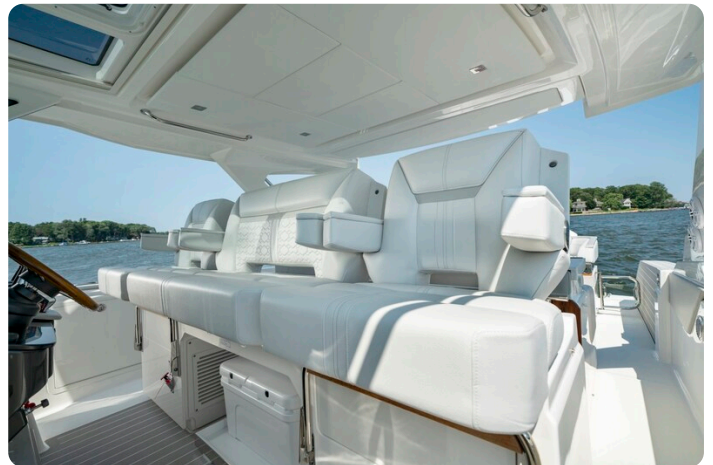
Tiara 43LS helm seats