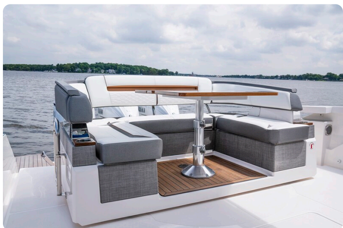
Tiara 43 LS aft dinette