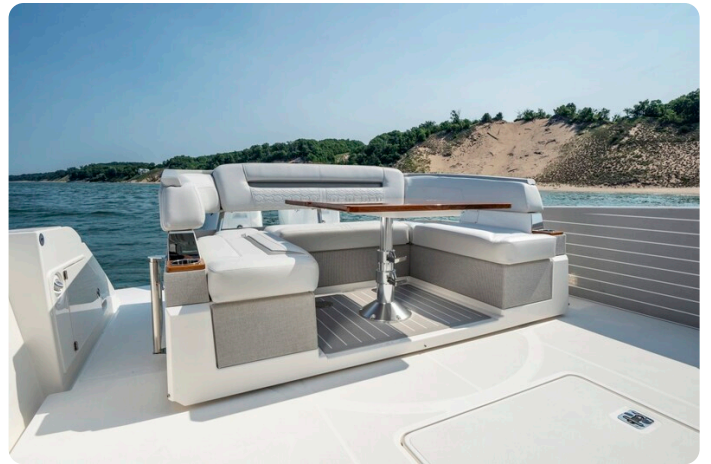
Tiara 43LS cockpit dinette