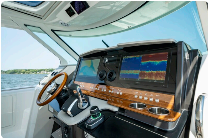
Tiara 43LS helm station