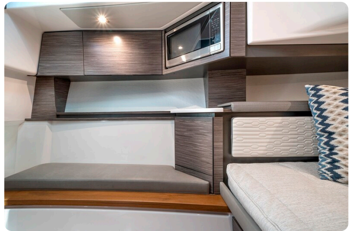
Tiara 43 LS interior detail