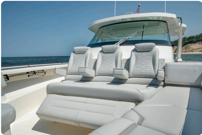
Tiara 43LS fwd seats