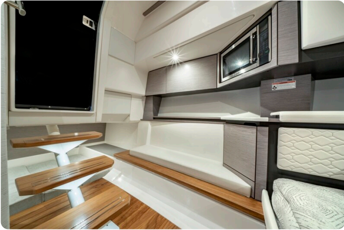
Tiara 43LS cabin details