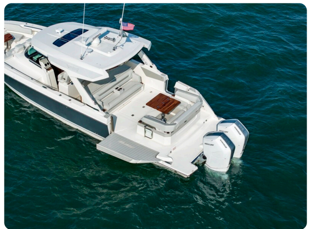
Tiara 43LS terrace detail