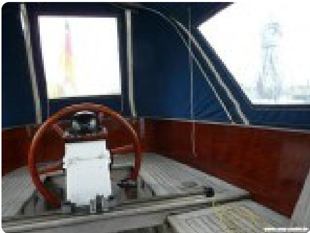
Vindö 50 msp269542 4