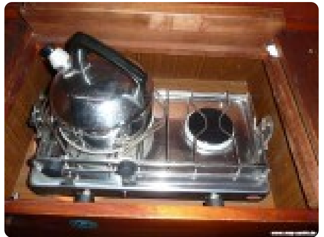
Vindö 50 msp269542 5