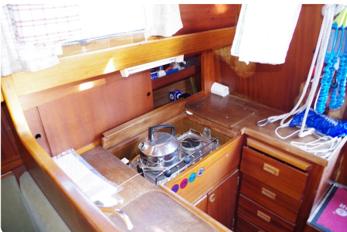
Vindö 50 msp269542 16