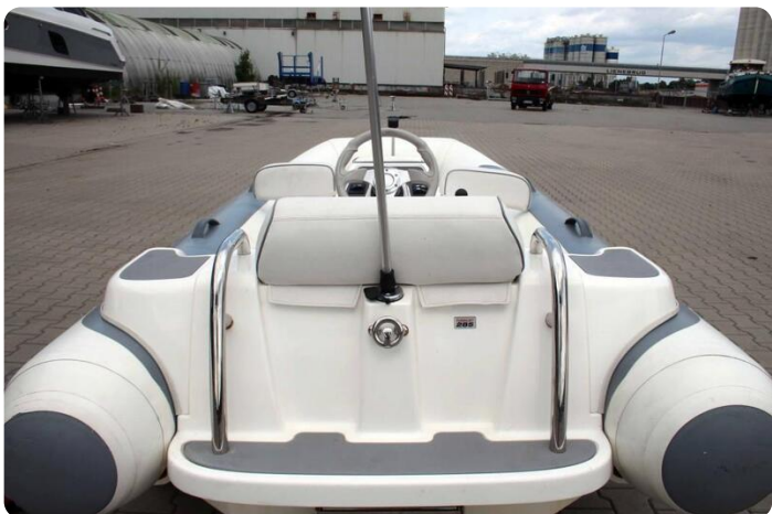
Williams Jet Tenders Turbojet 285