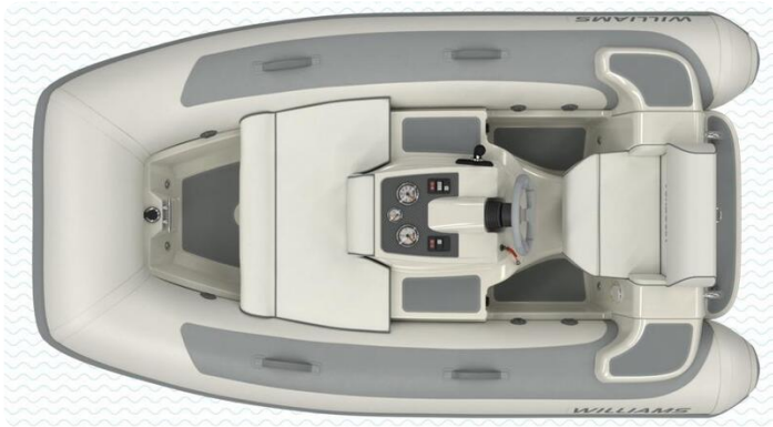
Williams Jet Tenders Turbojet 285