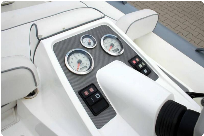
Williams Jet Tenders Turbojet 285