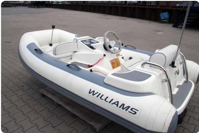
Williams Jet Tenders Turbojet 285