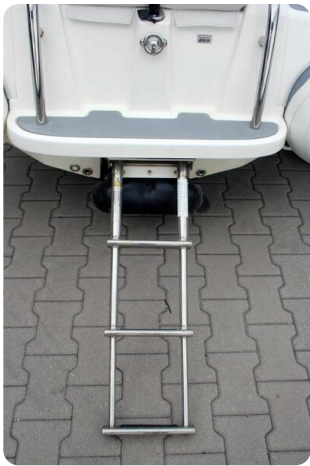
Williams Jet Tenders Turbojet 285