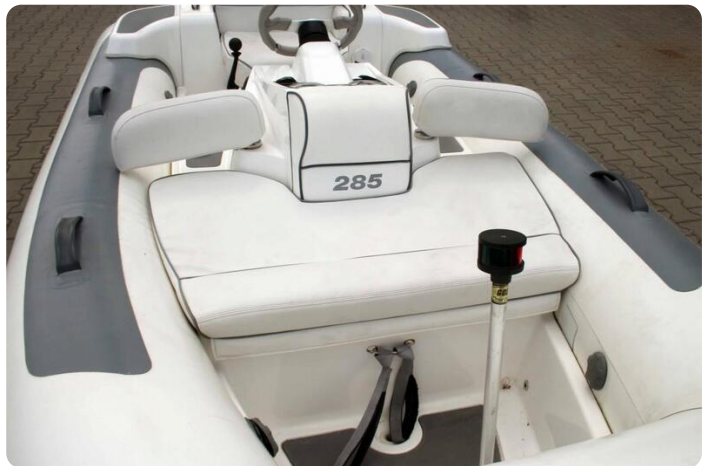
Williams Jet Tenders Turbojet 285