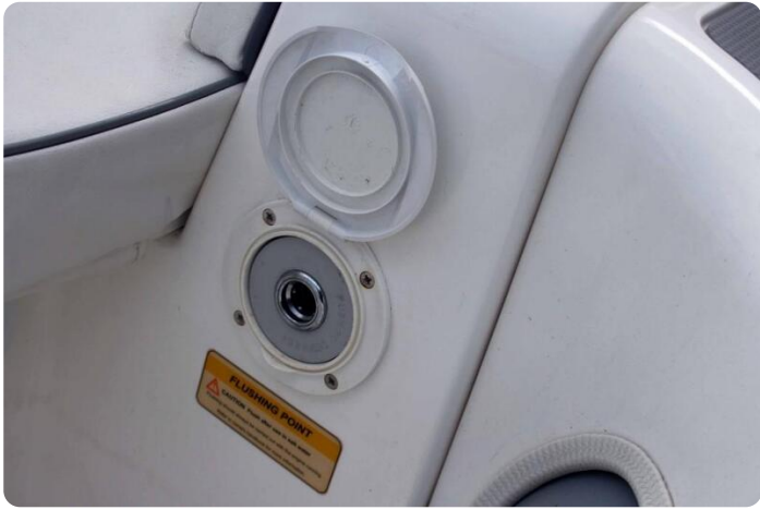
Williams Jet Tenders Turbojet 285