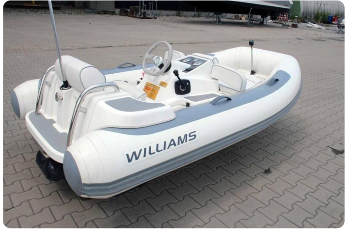
Williams Jet Tenders Turbojet 285