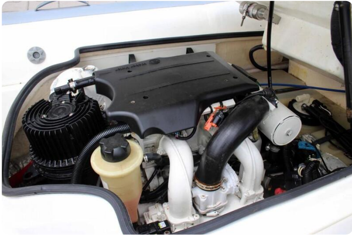
Williams Jet Tenders Turbojet 285