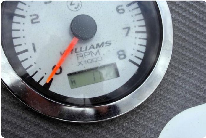
Williams Jet Tenders Turbojet 285