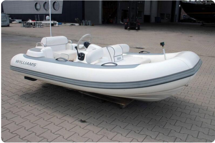
Williams Jet Tenders Turbojet 285