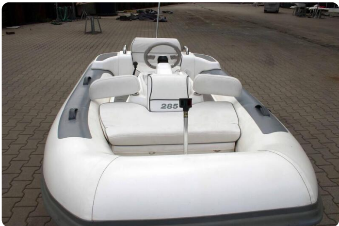
Williams Jet Tenders Turbojet 285