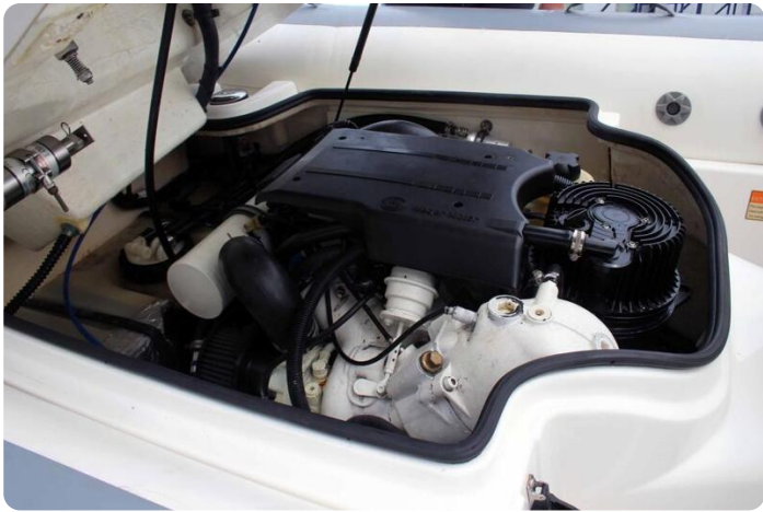
Williams Jet Tenders Turbojet 285