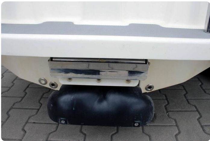
Williams Jet Tenders Turbojet 285