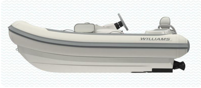
Williams Jet Tenders Turbojet 285