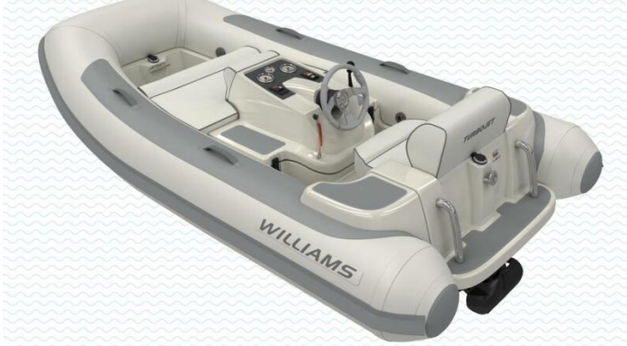
Williams Jet Tenders Turbojet 285