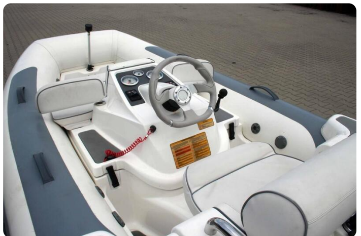
Williams Jet Tenders Turbojet 285