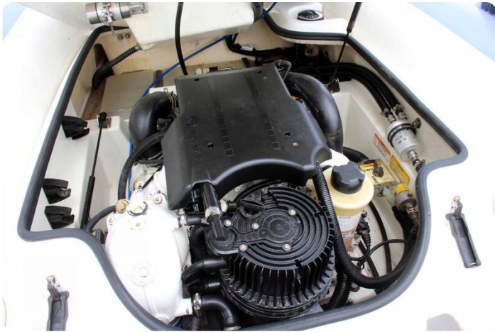
Williams Jet Tenders Turbojet 285