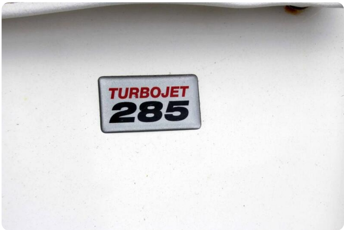
Williams Jet Tenders Turbojet 285